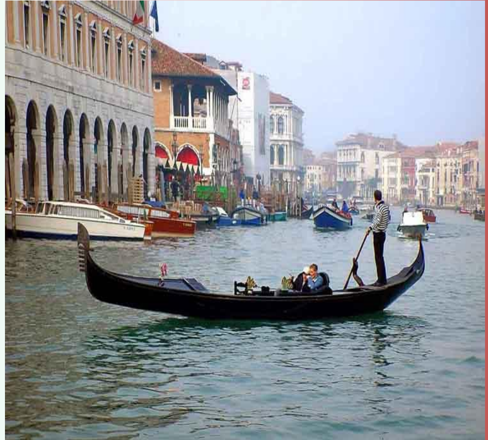
Venice Channel. Typical Venice boat: Gondola