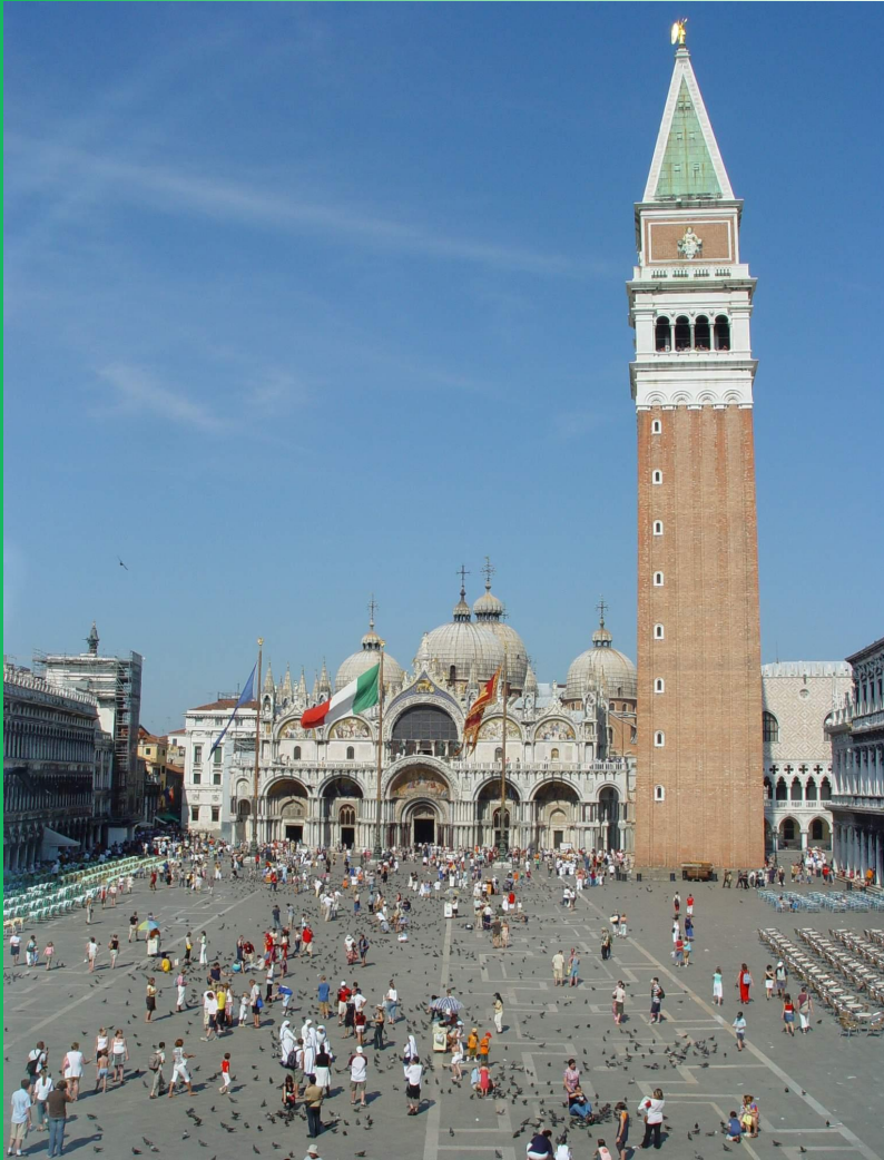
San Marco Square