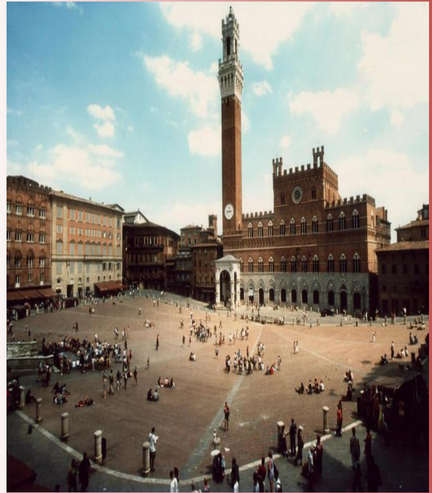
Pallio di Siena