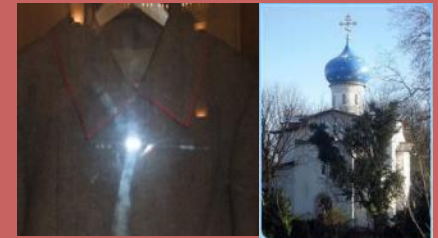
Tsar Nicholas ' greatcoat is kept in Russian Church in London