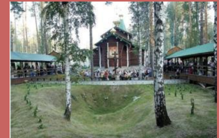
A few months later they were gunned down and their bodies were put to this pit called Ganina Yama