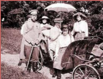
Royal family was arrested and sent to Yekaterinburg