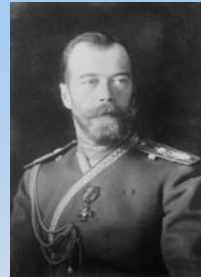
Tsar Nicholas II