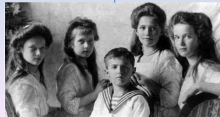
Grand Duchesses and Tsarevich Alexey