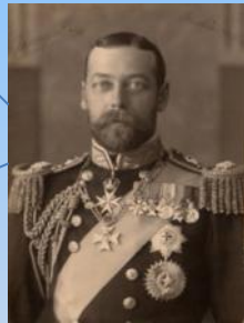
King George V