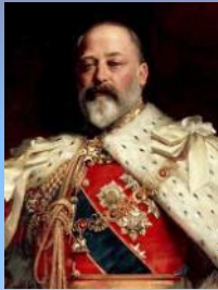
King Edward VII