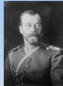
Tsar Nicholas II