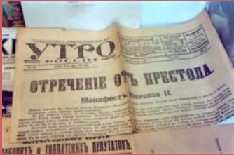
Nicholas II renounced to the throne

Revolution in 1917 put an end to Romanov reign