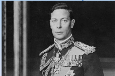
King George VI