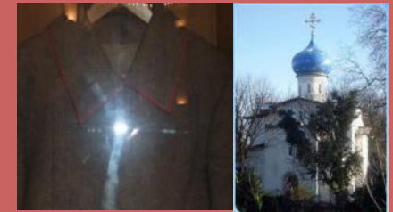
Tsar Nicholas ' greatcoat is kept in Russian Church in London