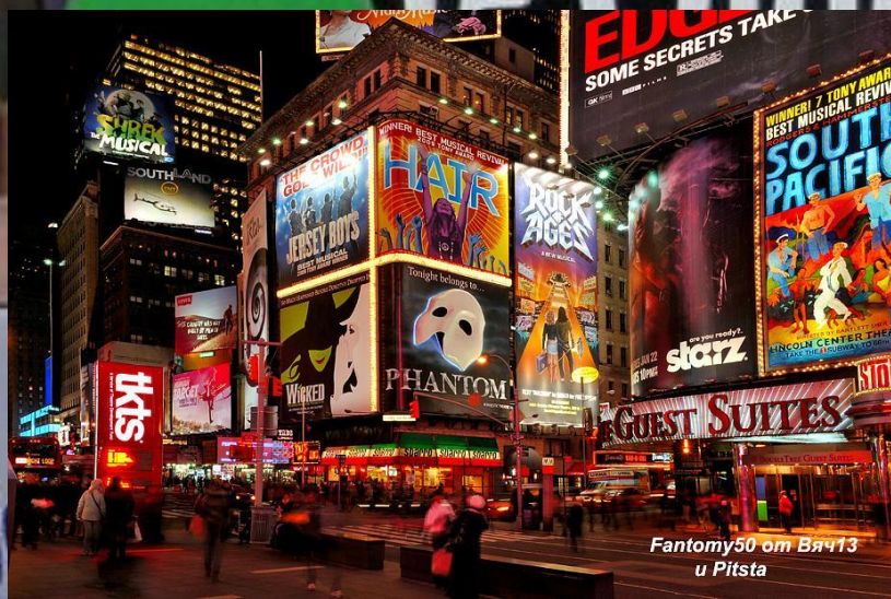
Fantomy50 от Вяч13 и Pitsta

The Sedona, is also located in this state. This magnificent city red rocks, known for their world for its unique beauty and charm. Sedona is located at an altitude of 1400 meters in the zone of high desert of Arizona. It welcomes you in four seasons with mild climate, making it an ideal holiday destination all year round. People from all over the world come here to recover and to enrich your life with new impressions. Why people from all over the world try to get here? The beauty of red cliffs, healing water oak Creek, in combination with the mysterious power of the local places of power, called here "the vortex", make the sedona spiritual Mecca. People who do not feel and do not even believe in the energy, note that this changes the mood and perception of the world. Many people here are beginning to feel the energy and its impact. Also here is the Grand canyon. This unique and sacred place.