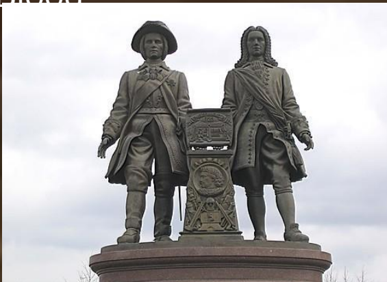
Monument Tatischev and Degenin