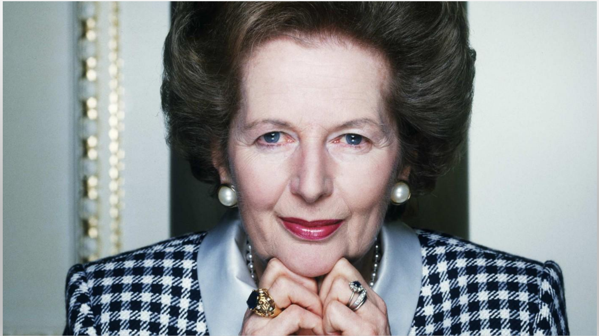
Margaret Thatcher (1925 - 2013)