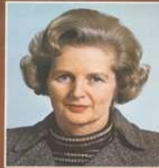
The Rt. Hon. Margaret Thatcher MP Leader of the Conservative Party