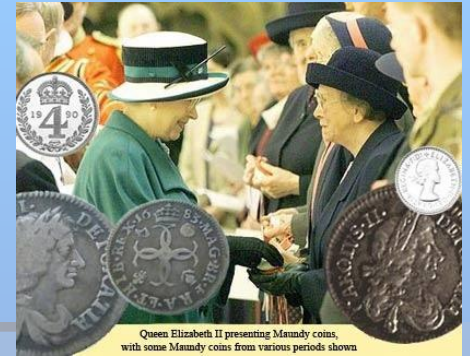
Queen Elizabeth II presenting Maundy coins, with some Maundy coins from various periods shown