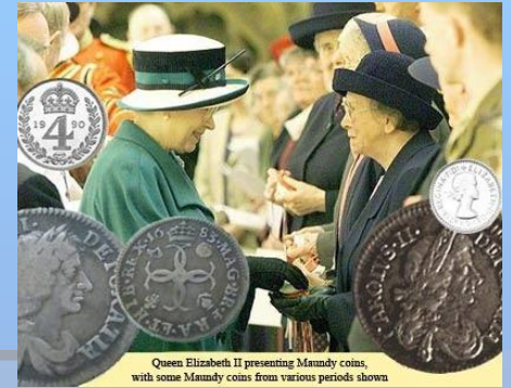
Queen Elizabeth II presenting Maundy coins, with some Maundy coins from various periods shown