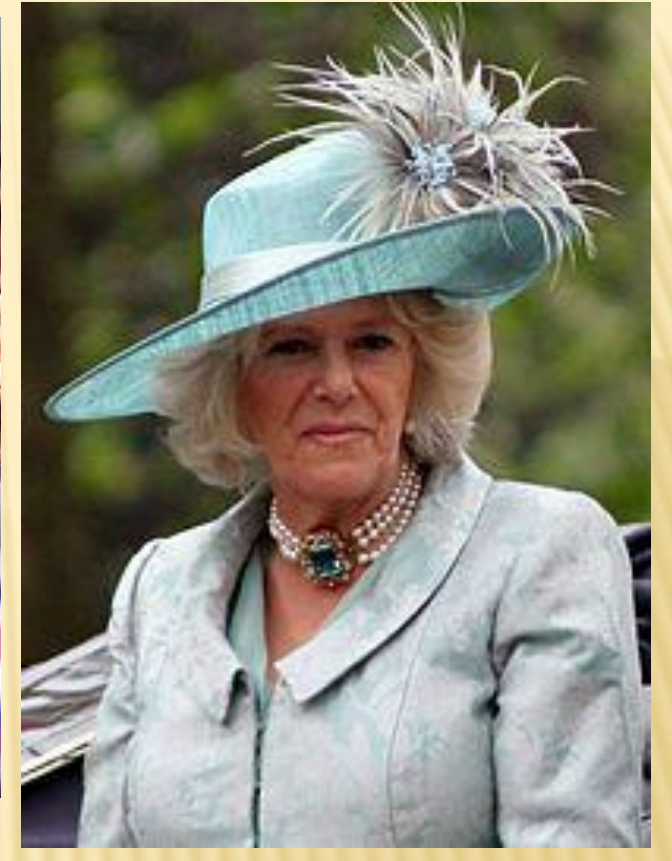
The second wife of Charles, Camilla Rosemary Mountbatten-Windsor.(1960)