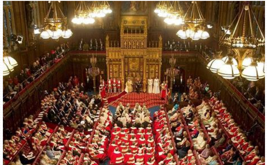
The House of Lords