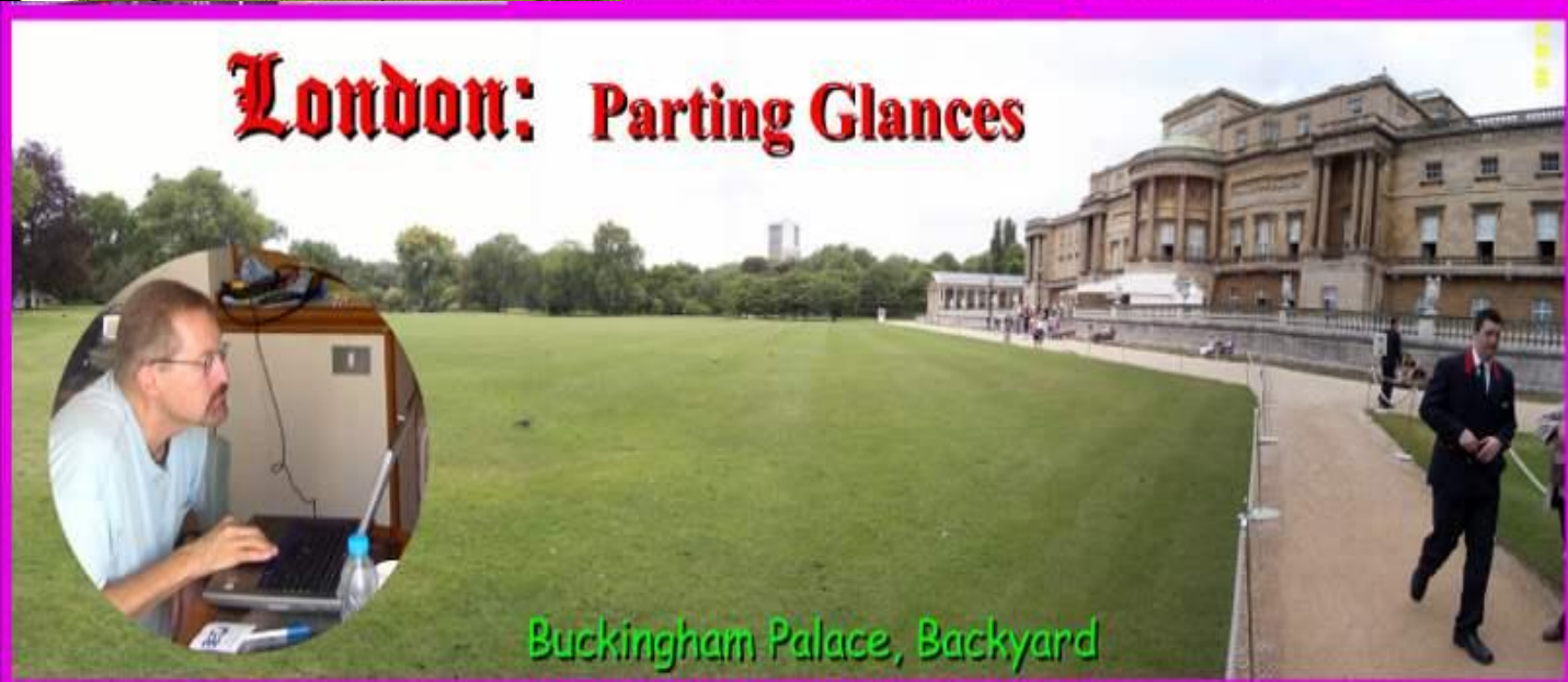
Buckingham Palace, Backyard