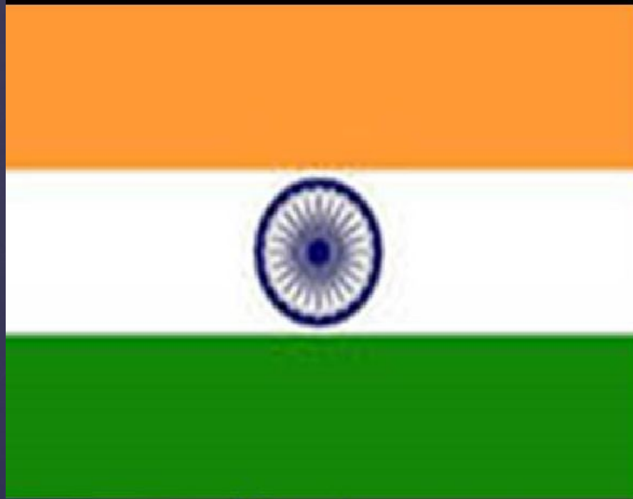
flag of India