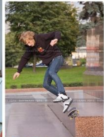
Молодежная субкультура © Алора, Меллерштейн / Егоробинс, Лопн