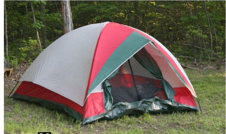
Tent - шатыр