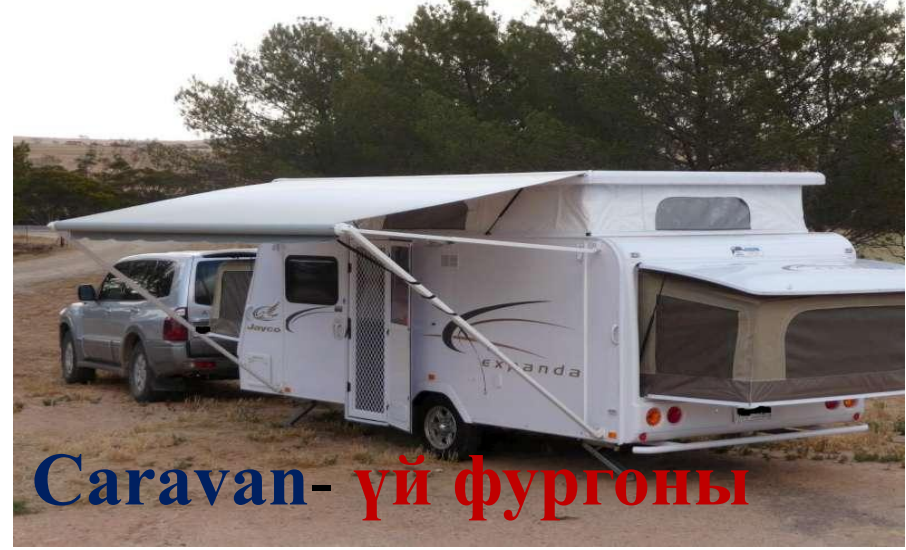
Caravan- үй фургоны