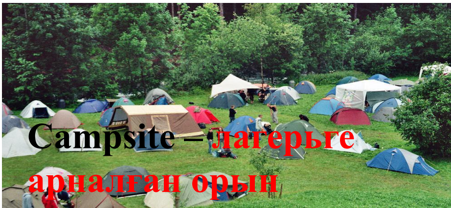
Campsite – лагерге арналған орын