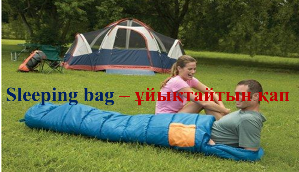
Sleeping bag – ұйықтайтын қап