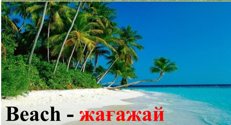
Beach - жағажай