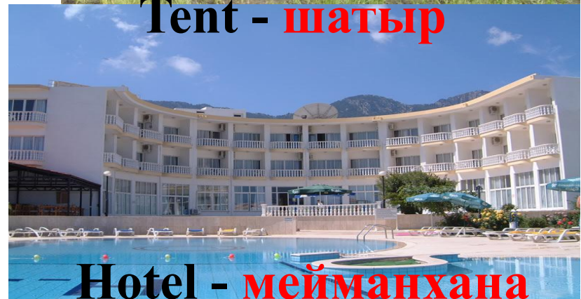
Hotel - мейманхана