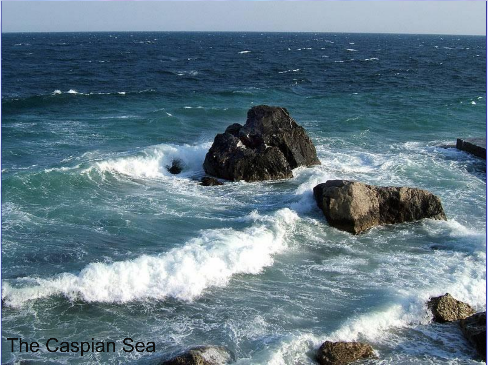
The Caspian Sea