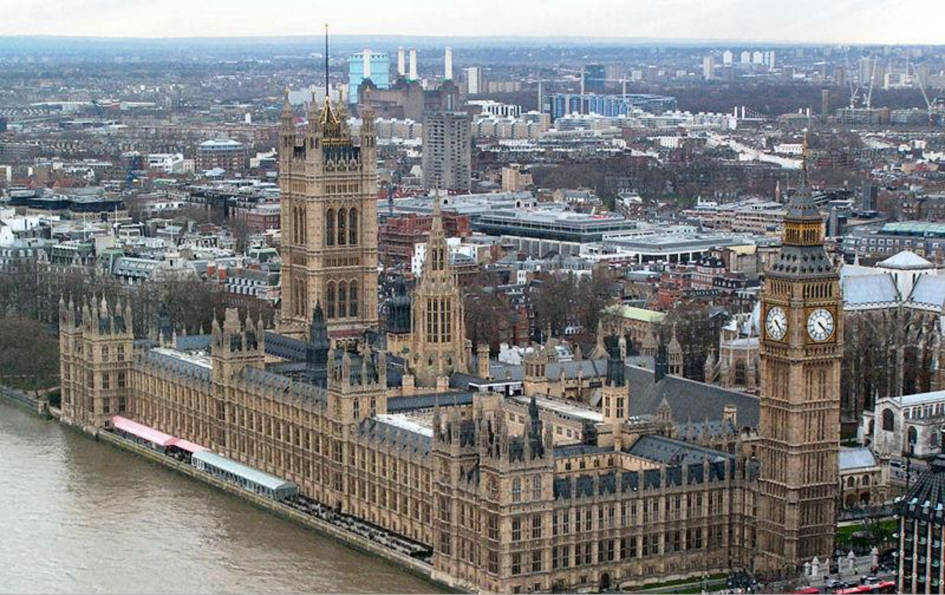
This building is called Westminster Palace or the Houses of Parliament which stands on the River Thames in London.