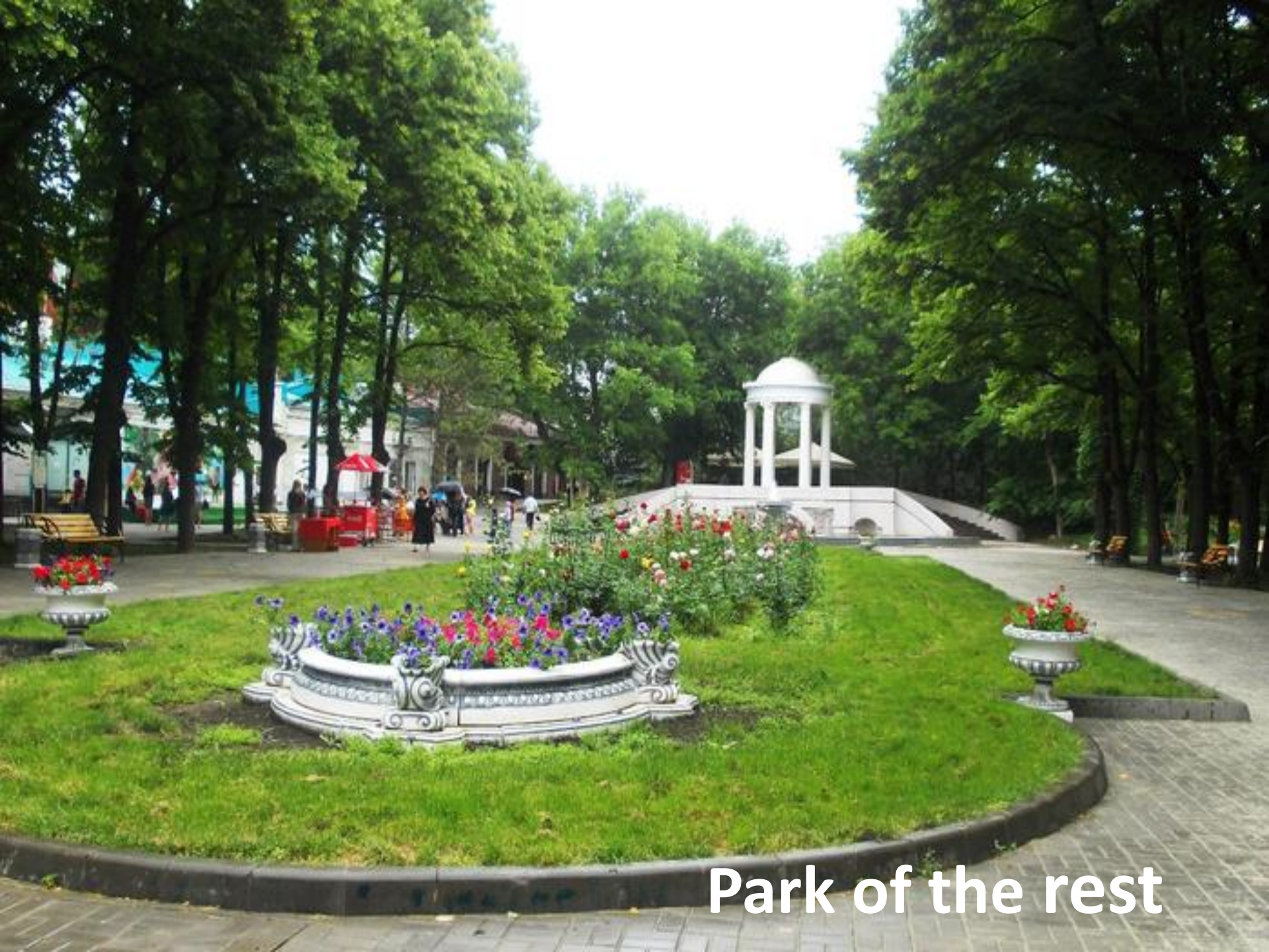
Park of the rest