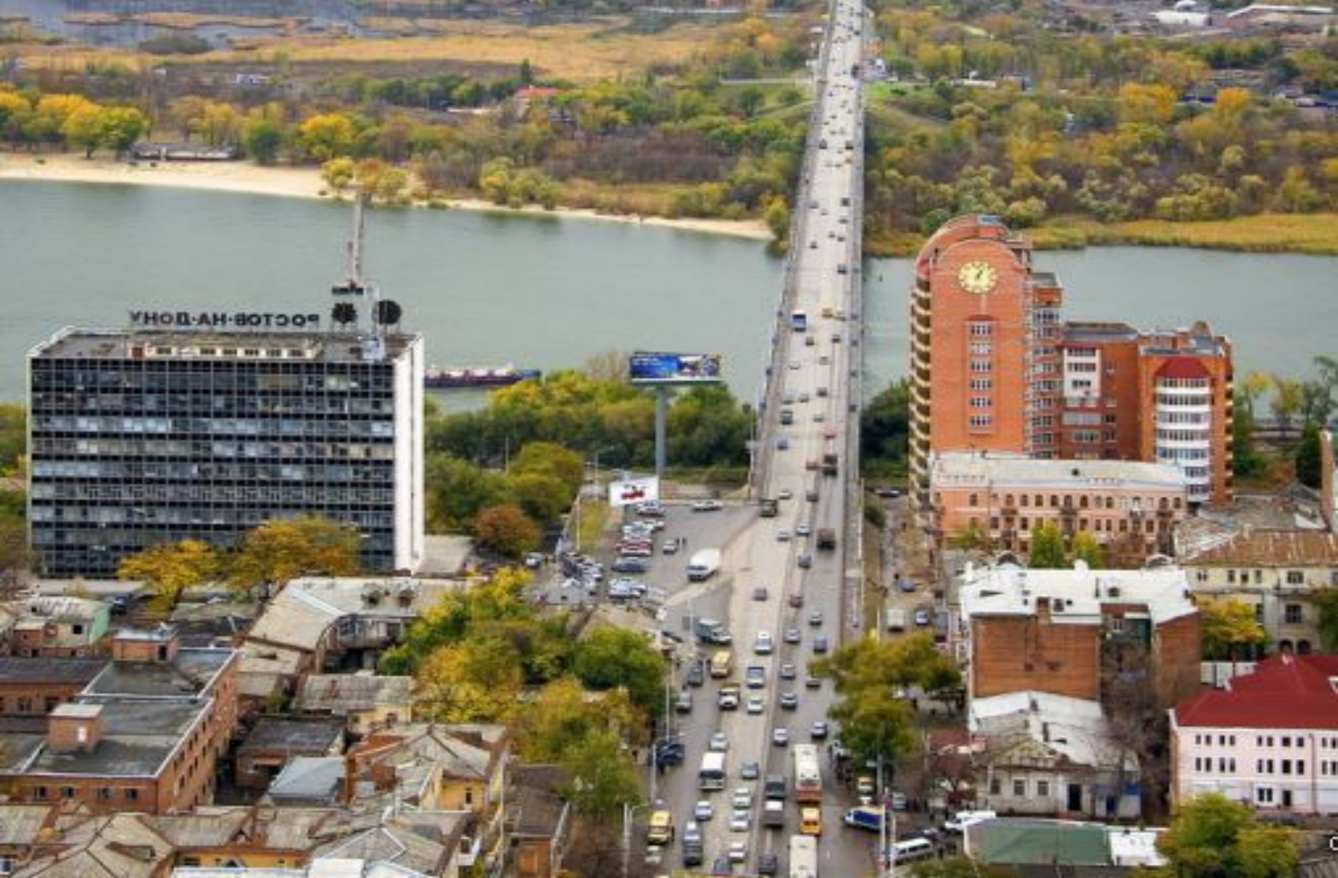
Voroshilovskiy bridge . He not simply separates the city on Right and Left coast, but also is a border between Europe and Asia