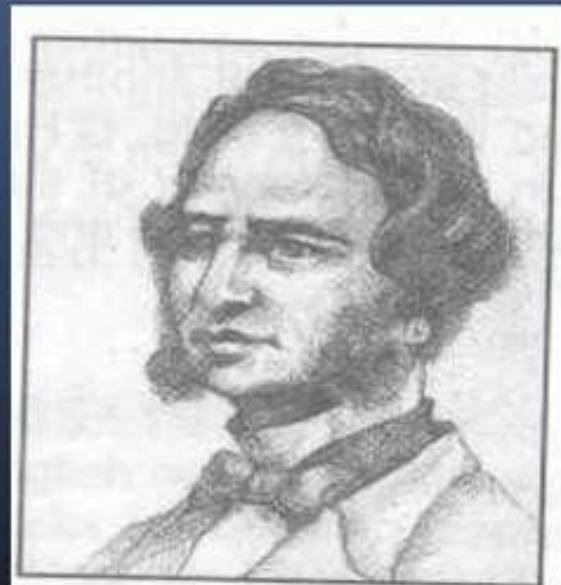
Henry Wadsworth Longfellow

Henry Wadsworth Longfellow was one of the most widely read American poets of the 19th century. From 1835 to 1854 he was Smith Professor of Modern Languages at Harvard. In 1884, 2 years after his death, he became the first American to be honoured with a bust in the Poets' Corner of Westminster Abbey, London. He is best remembered for poems such as "The Song of Hiawatha" and "Paul Revere's Ride."