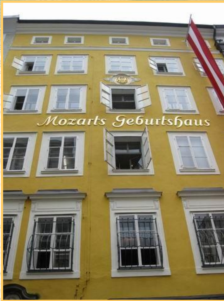
The house where the family of the composer lived