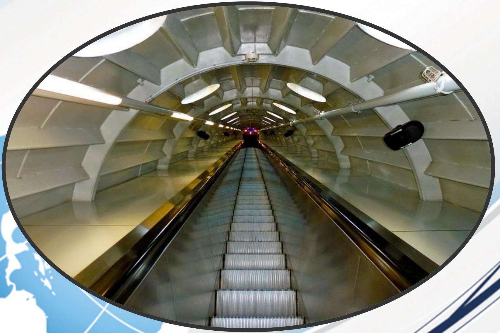
Atomium. The escalator in the connecting pipe