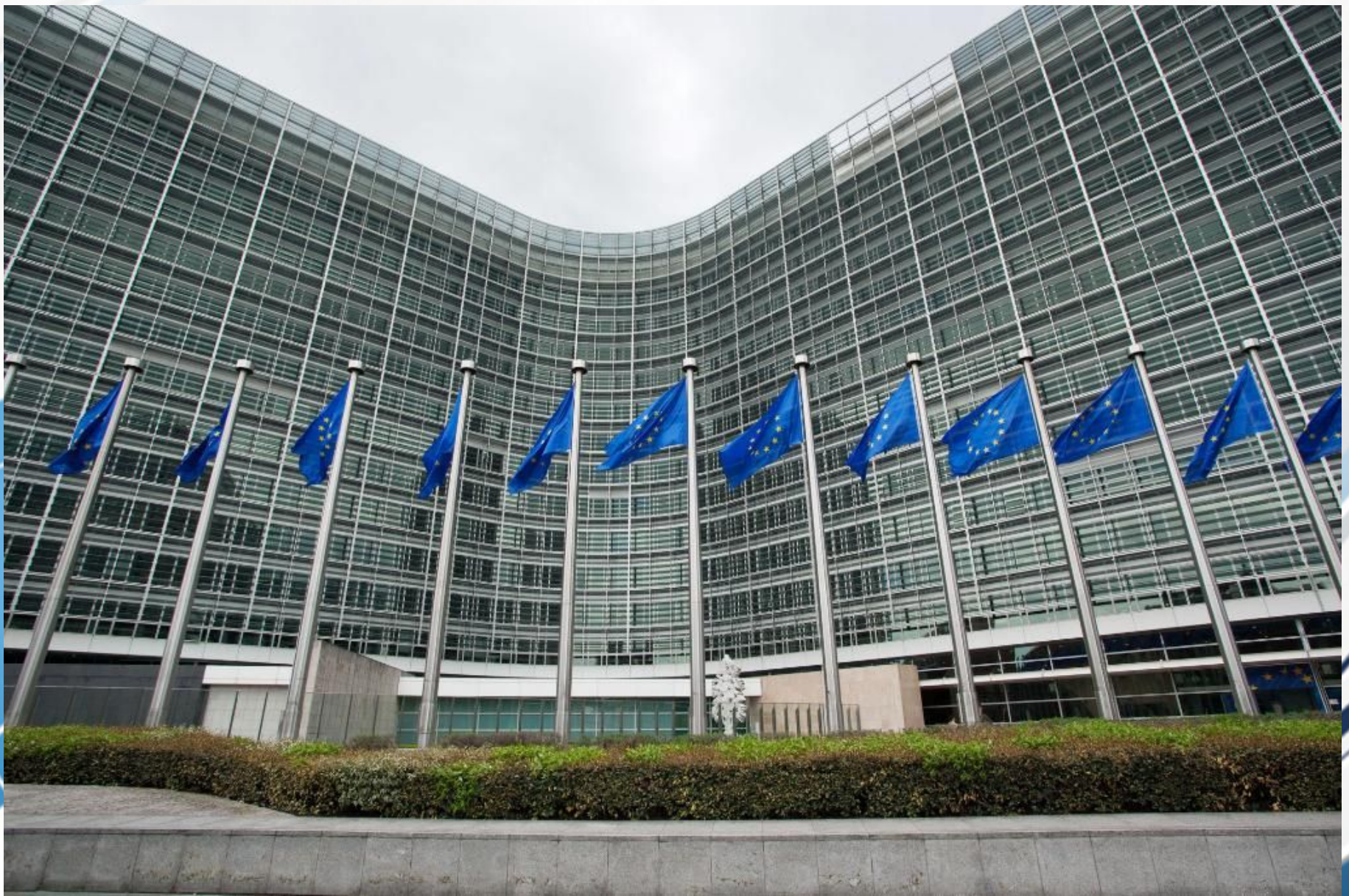
The Headquarter of the European Union in Brussels