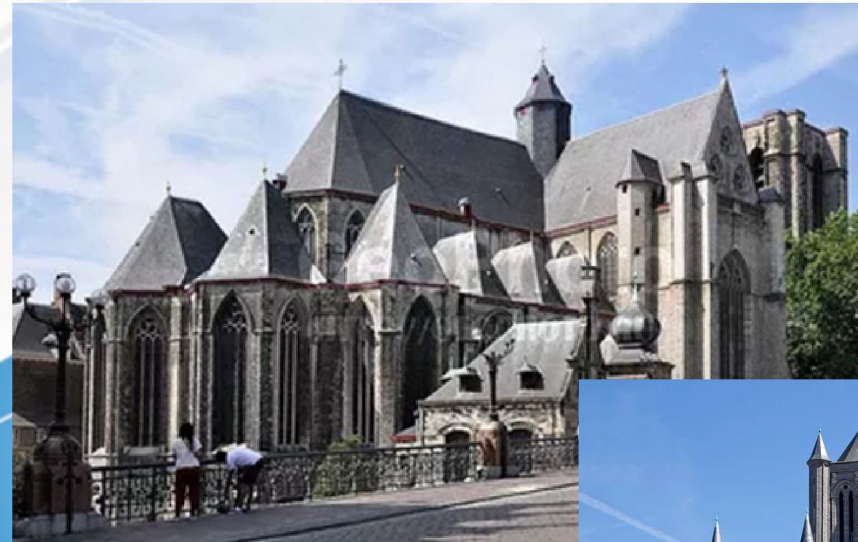
St. Michael's church