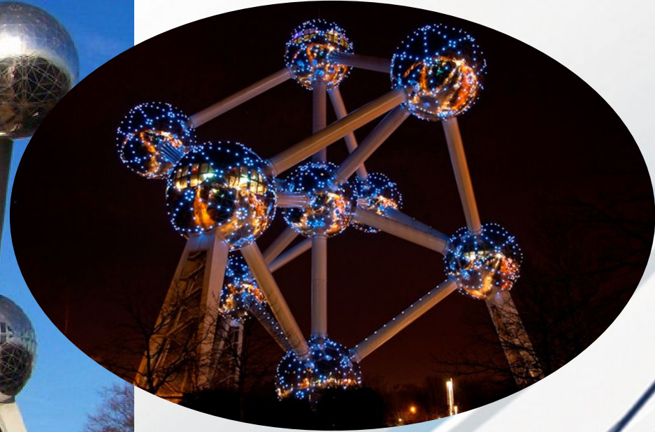
Atomium at night

Atomium is the symbol of modern Brussels