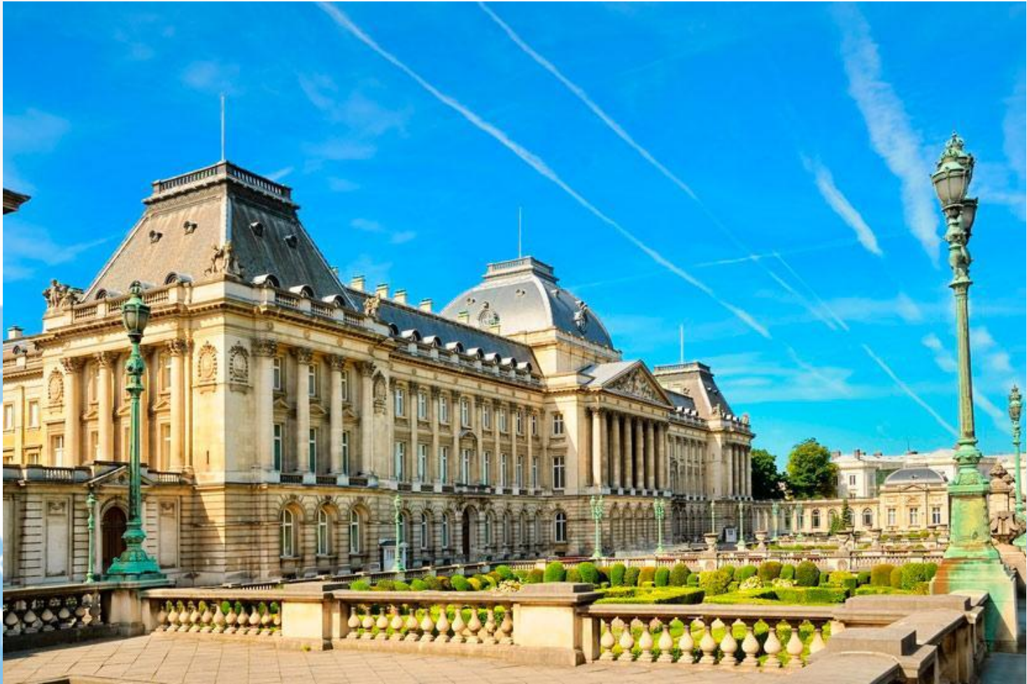
The Royal Palace in Brussels