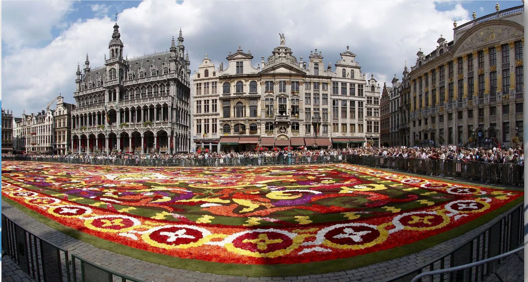
The central square Grand Palace. The Flower Parade in Brussels.