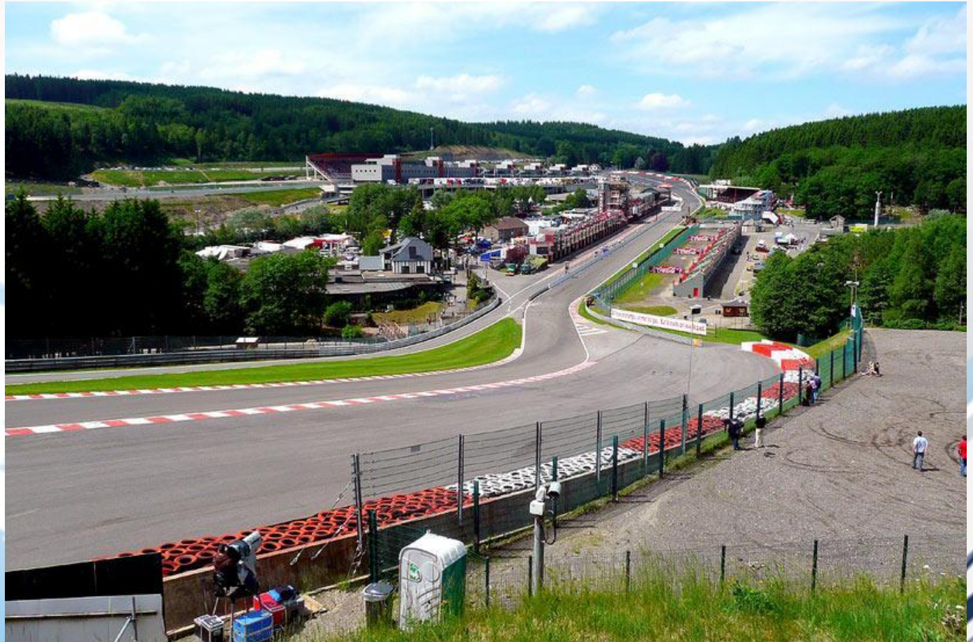
Spa-Francorchamps route of 'Formula-1' by Jules de Trier. The first grand prix was in 1950.