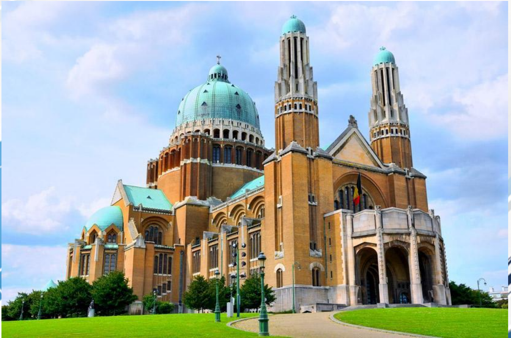
Basilica of Sacre-Coeur in Brussels