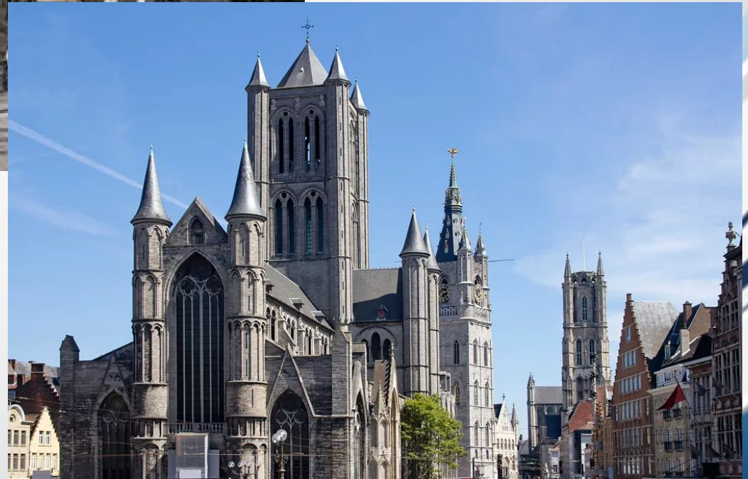
St. Nicholas church