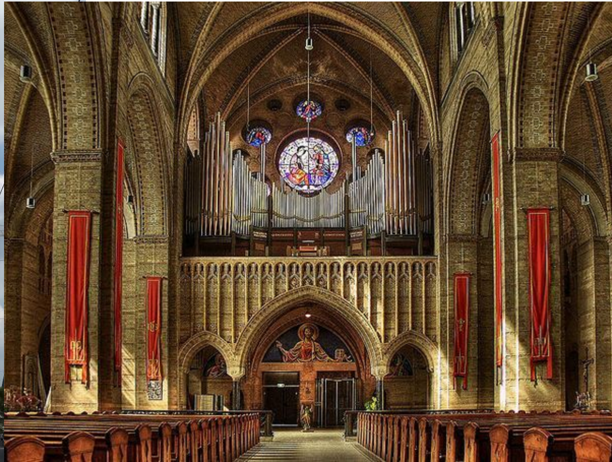
Saint Bavo Cathedral with Jan van Eyck's paintings