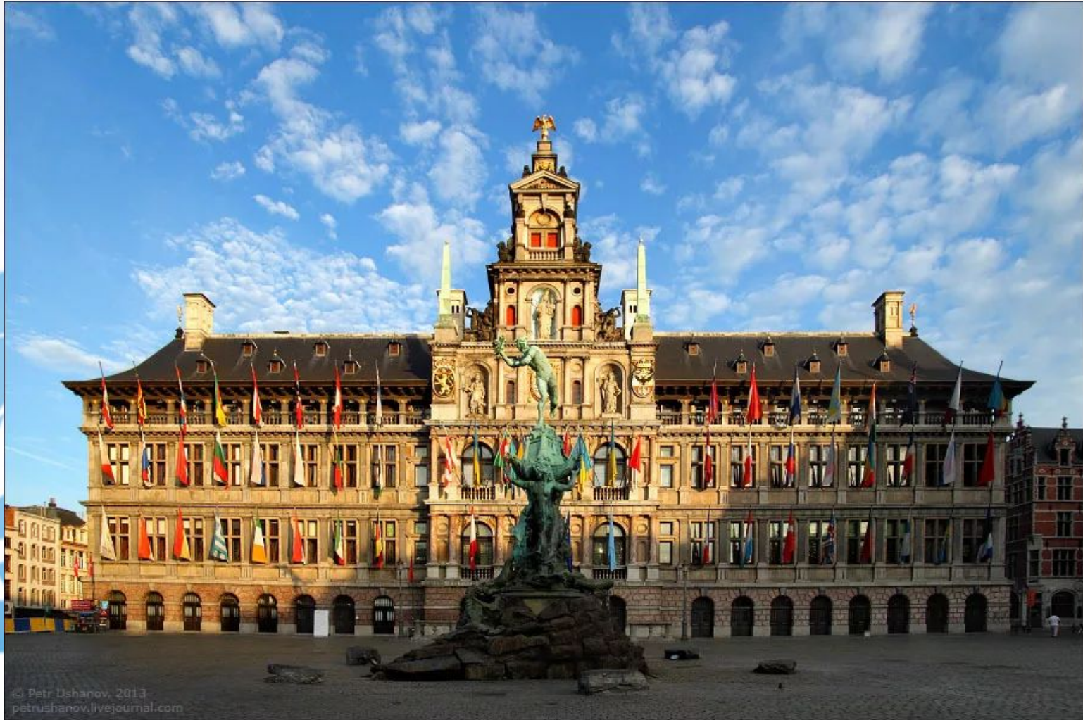
Town Hall in Antwerp