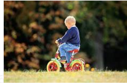
Ride a bike