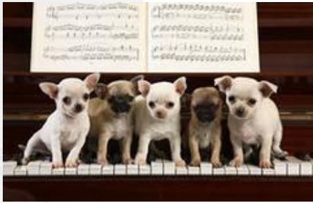
Play the piano

Look at the pictures and say what you CAN or CAN`T do.