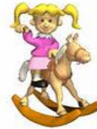
Ride a horse