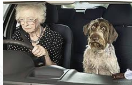
Drive a car