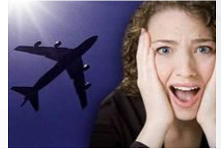
Fly the plane