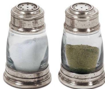
salt and pepper