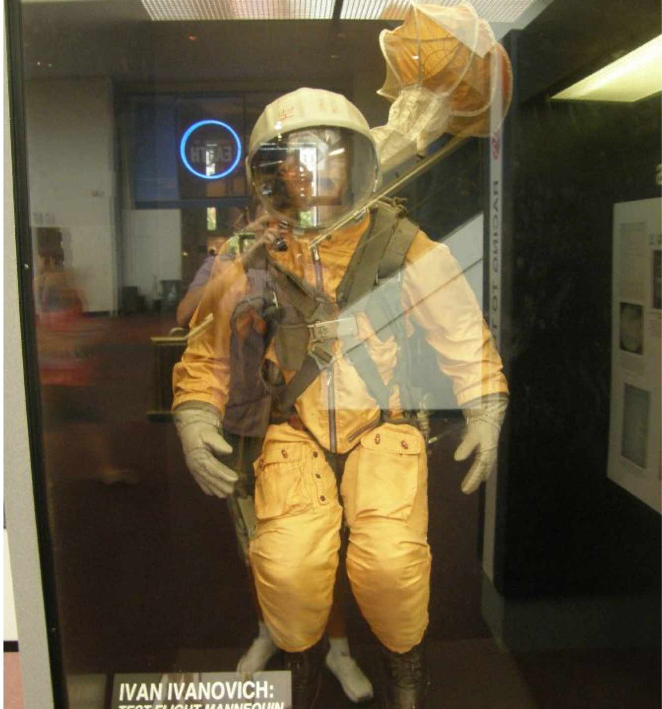
IVAN IVANOVICH: TEST FLIGHT MANNEQUIN