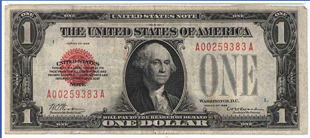
George Washington on the 1928 dollar bill