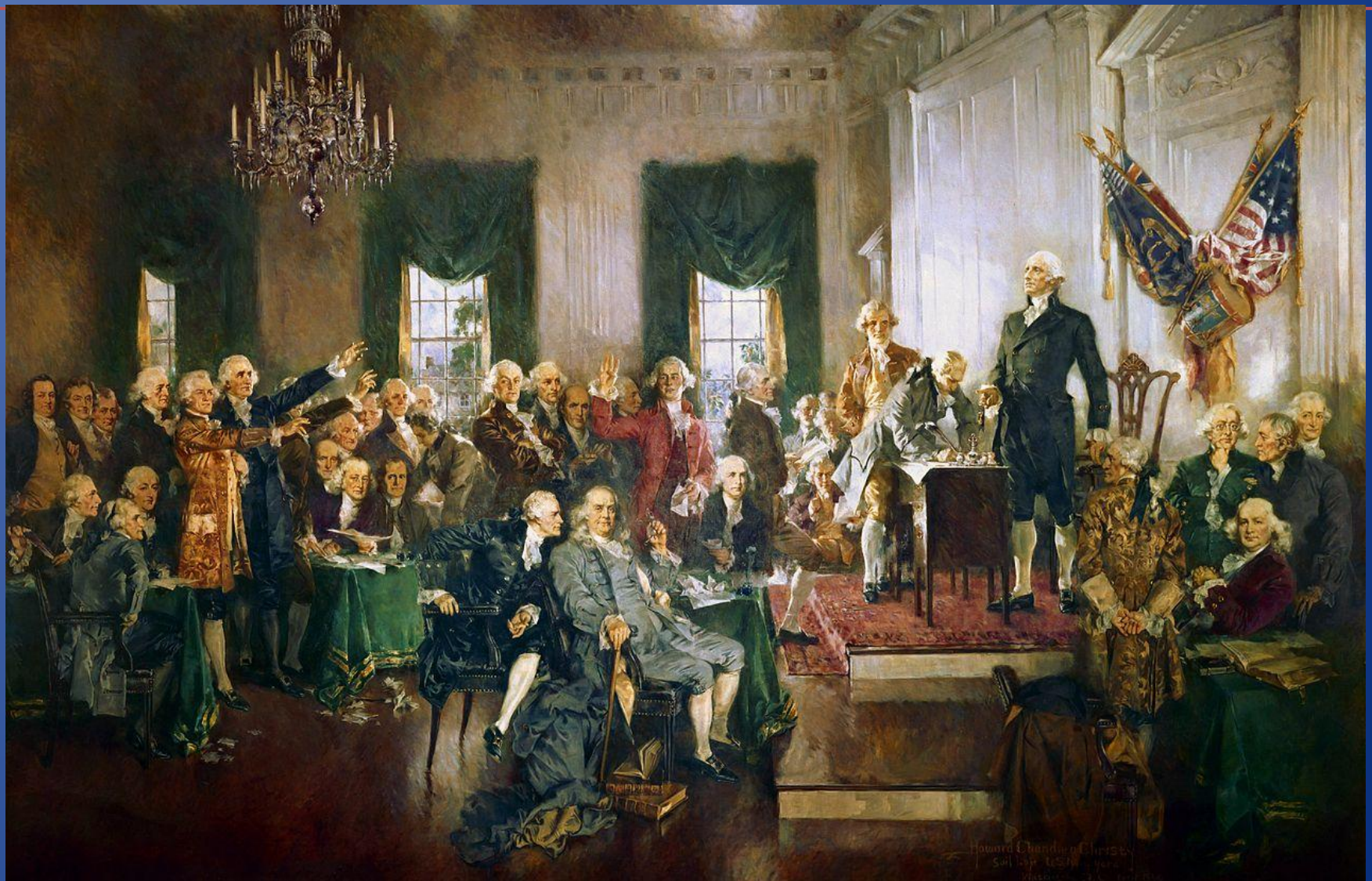
Scene at the Signing of the U.S. Constitution by Howard Chandler Christy, 1940