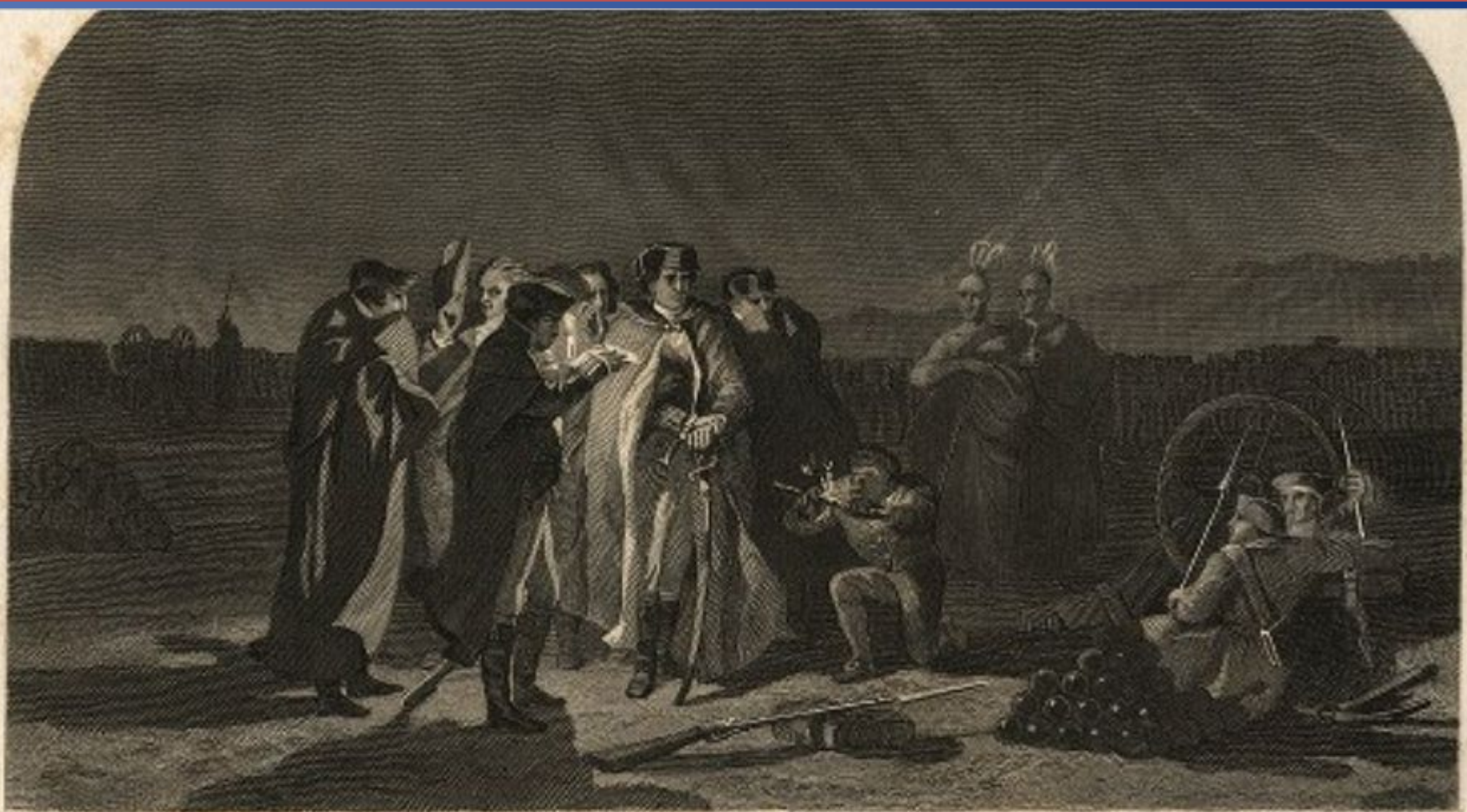
THE NIGHT COUNCIL AT FORT NECESSITY

(From the original drawing in the possession of the publisher) 1757