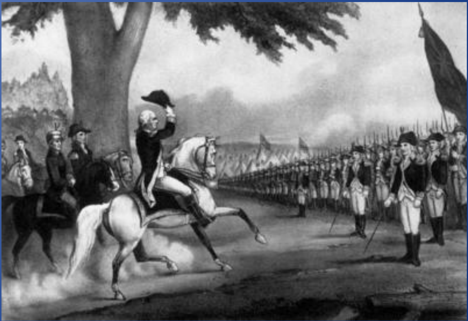
Washington taking Control of the Continental Army, 1775