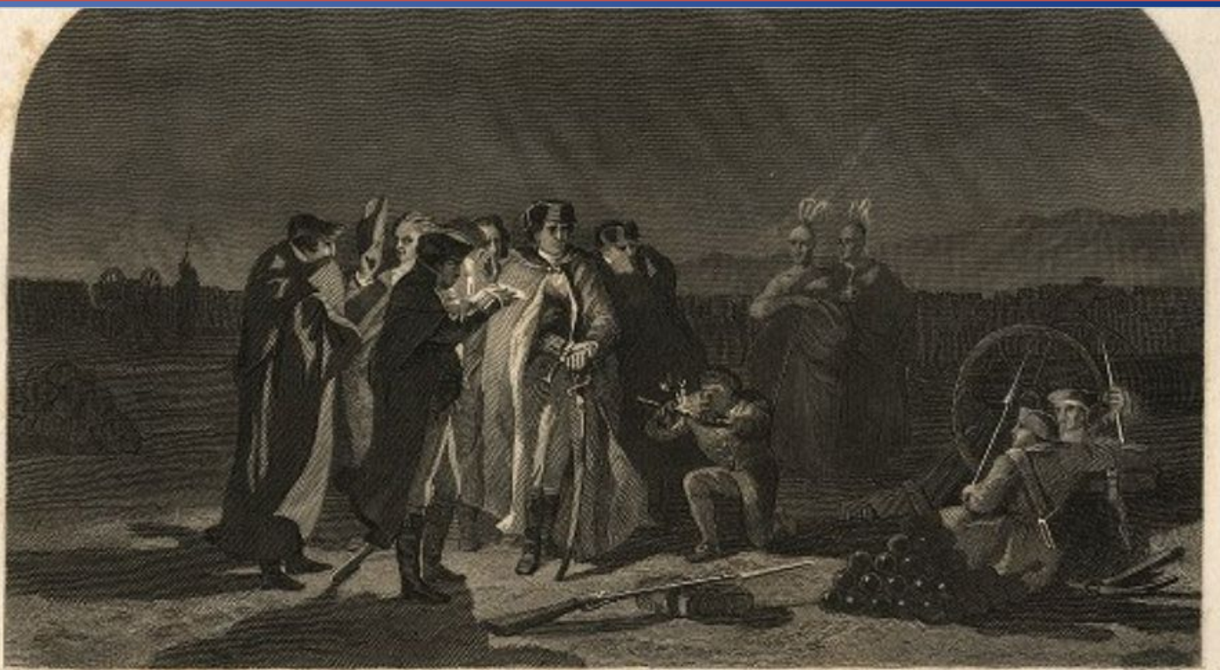
THE NIGHT COUNCIL AT FORT NECESSITY

(From the original drawing in the possession of the publisher) 1757