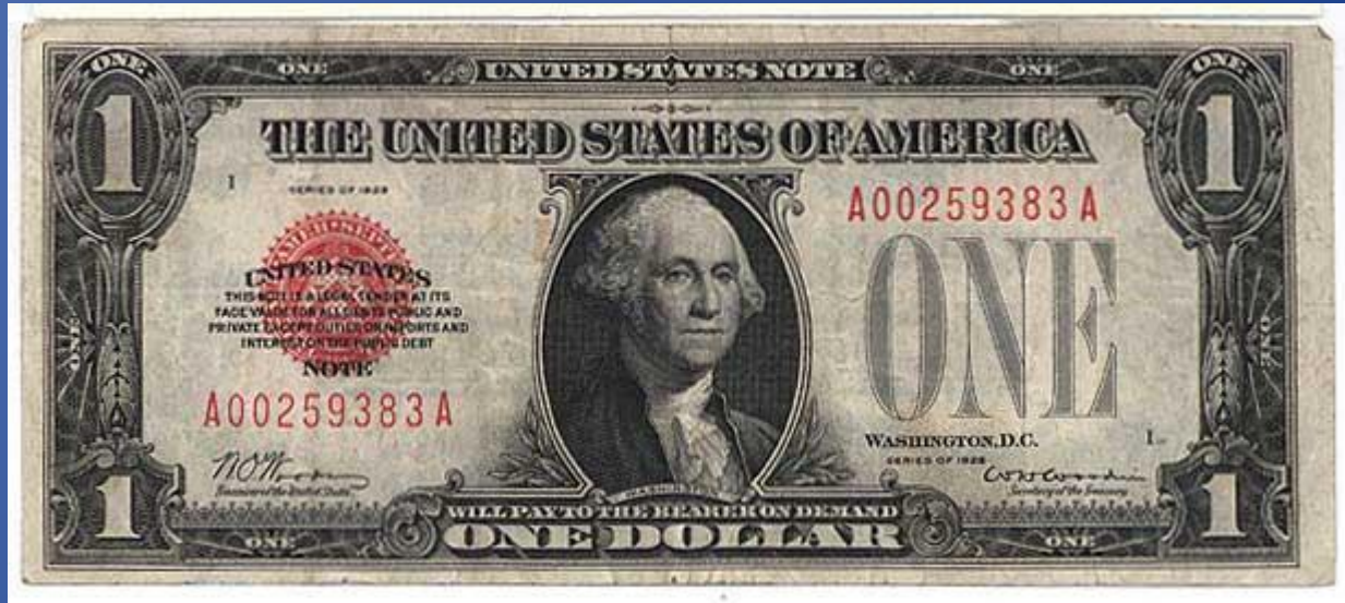
George Washington on the 1928 dollar bill