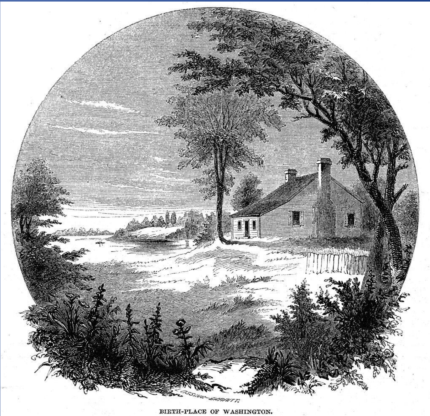
BIRTH-PLACE OF WASHINGTON.