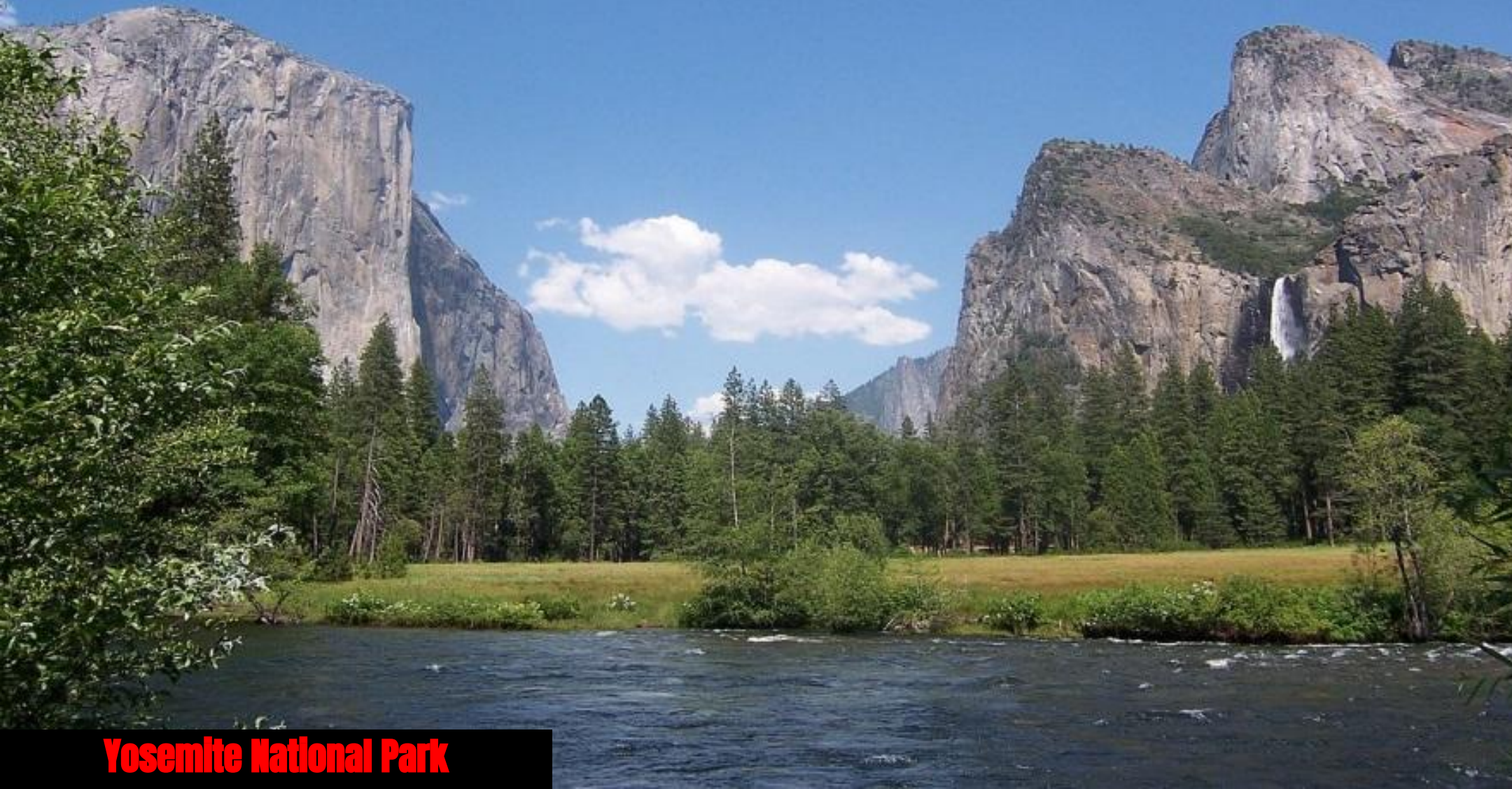
Yosemite National Park