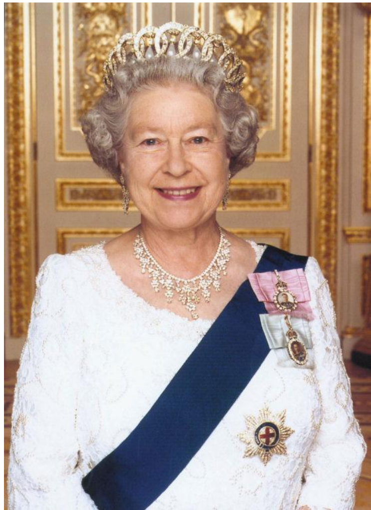
Queen Elizabeth II

THE HEAD OF STATE IN BRITAIN IS THE QUEEN