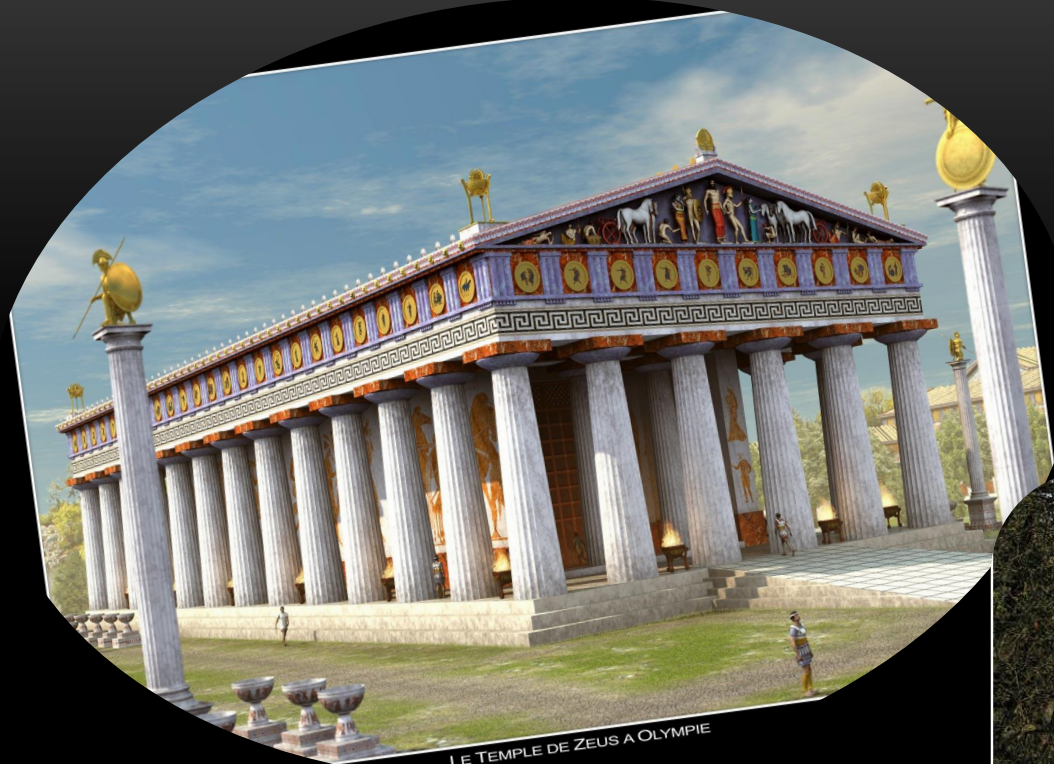
LE TEMPLE DE ZEUS A OLYMPIE