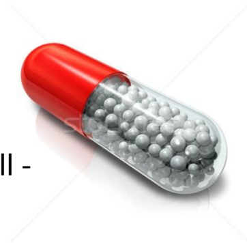
Model of standard pill -