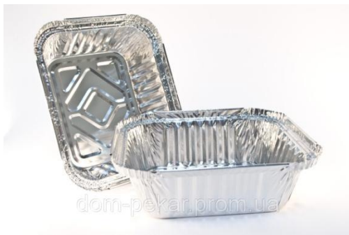
- Foil dish