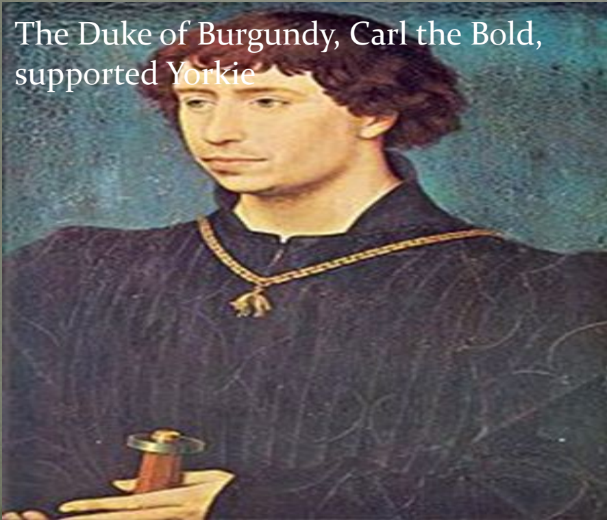
The Duke of Burgundy, Carl the Bold, supported Yorkie