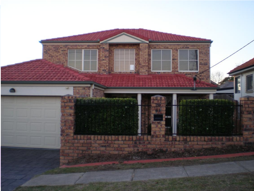
The house we live in