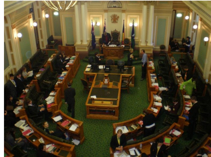
usual day of the parliament