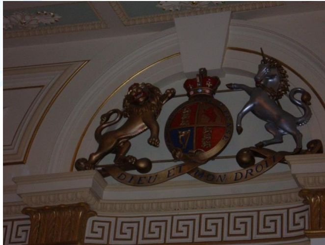
coat of arms