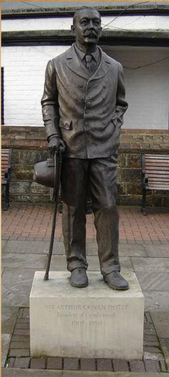
Arthur Conan Doyle statue in Crowborough