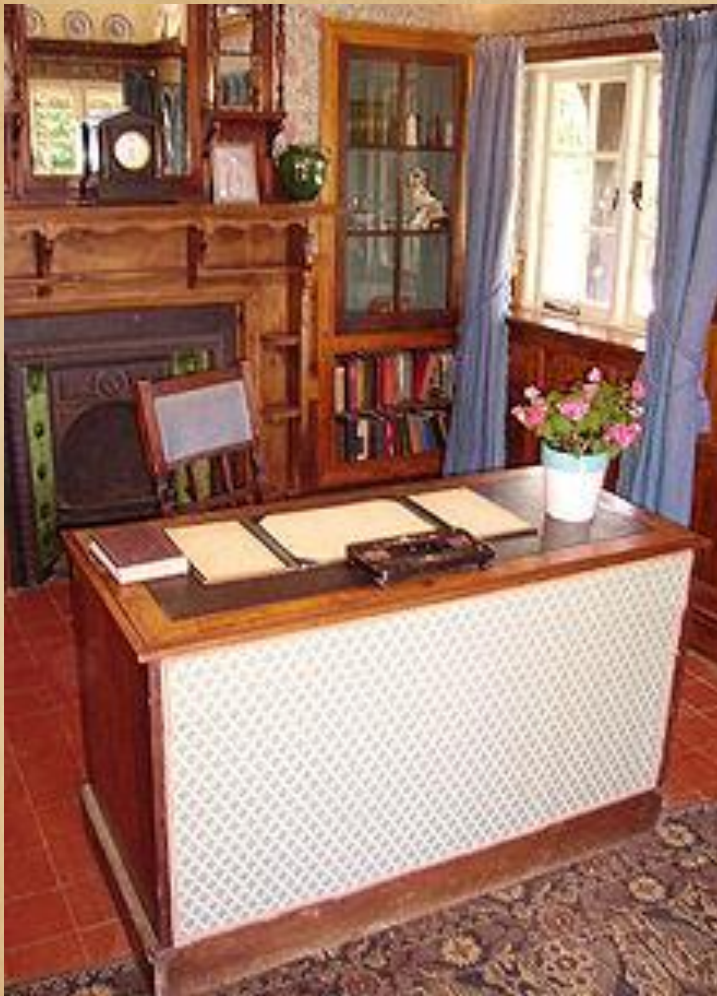
Doyle's study at Groombridge Place