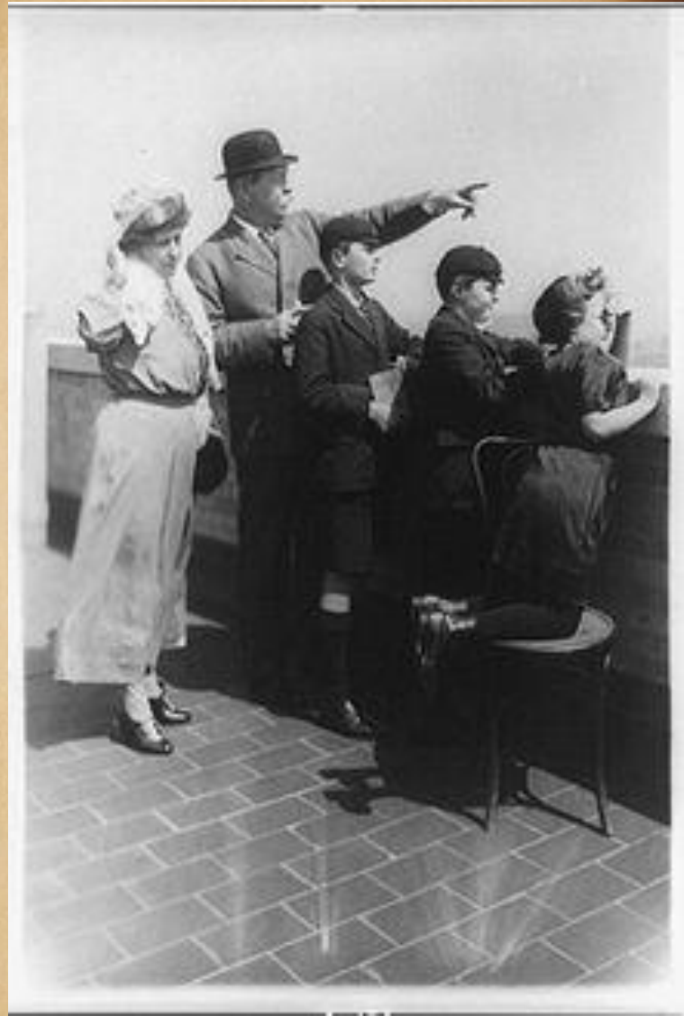
Conan Doyle's family in New York 1922