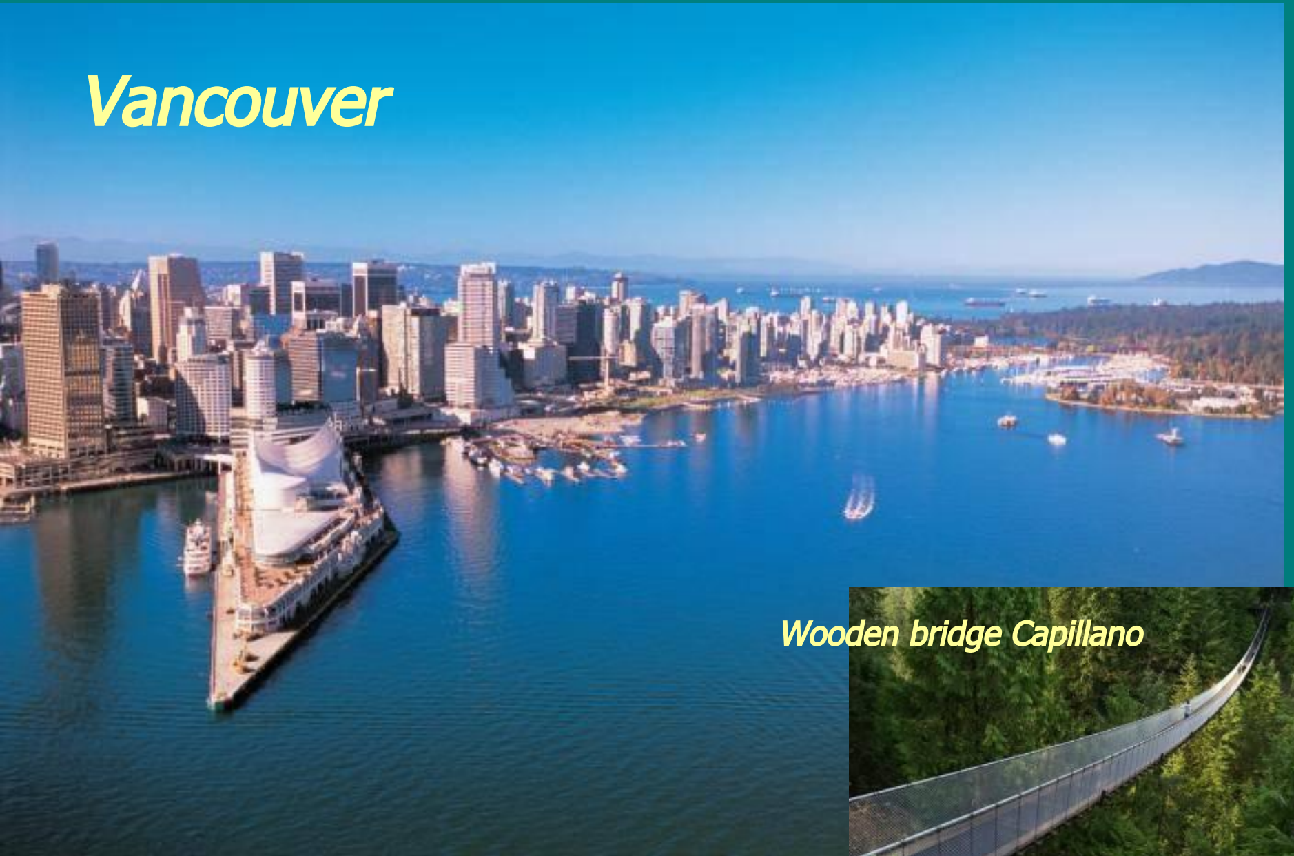
Wooden bridge Capillano