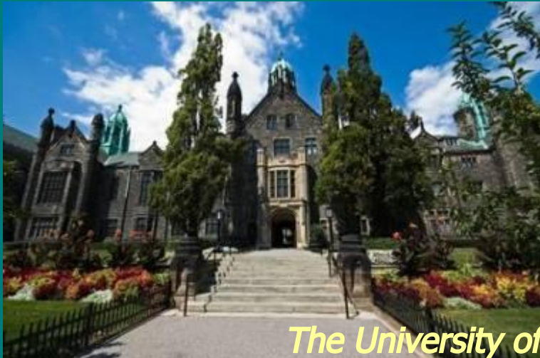
The University of Toronto