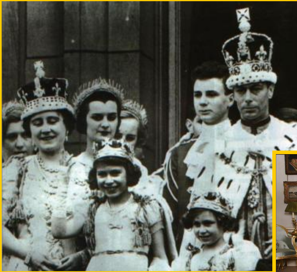
Elizabeth II with a sister and parents