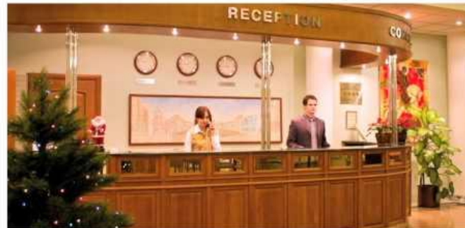
Лобби - Lobby