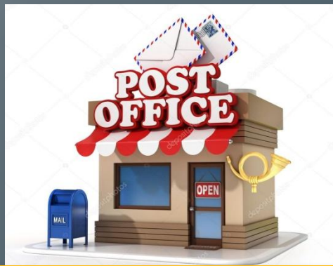
1. Post Office