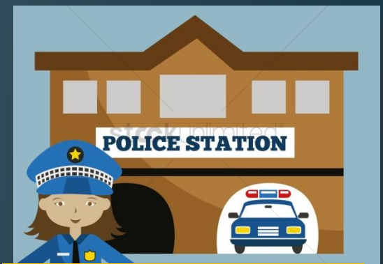
3. Police Office