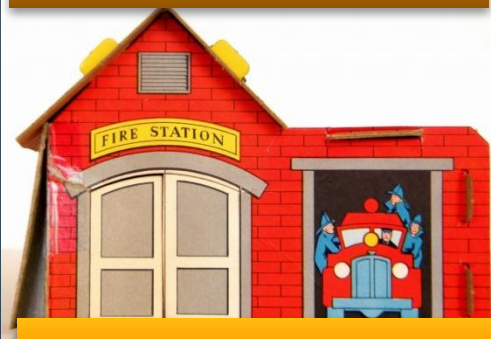
7. Fire Station