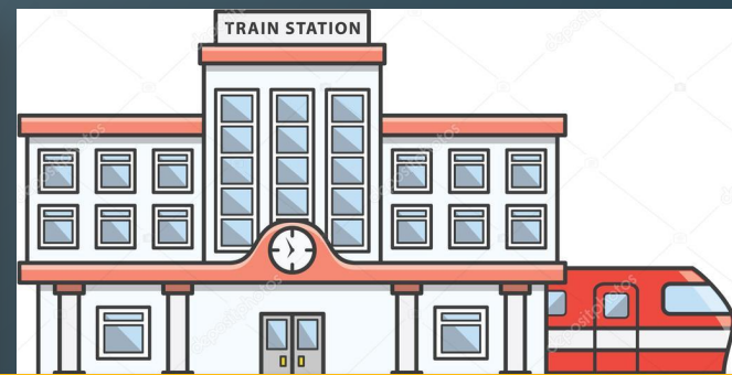
5. Railway Station