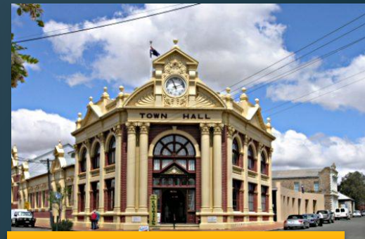
6. Town Hall