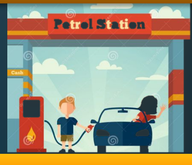
9. Petrol Station