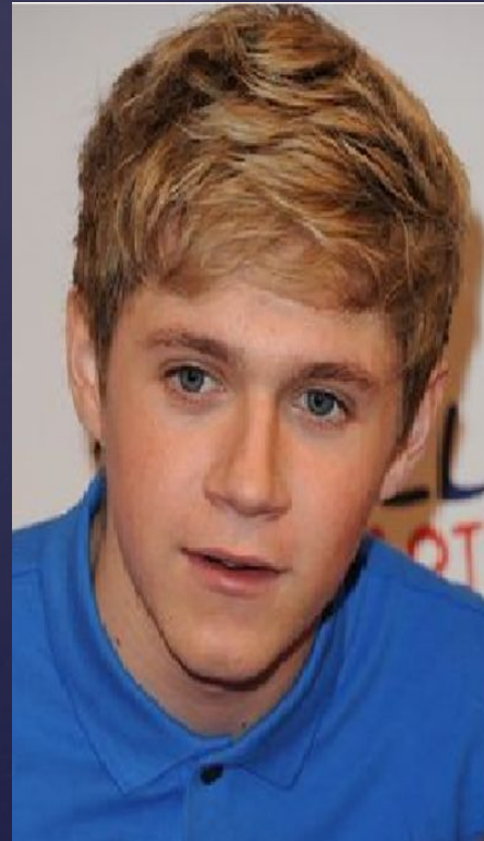
This is Nemo from Australia