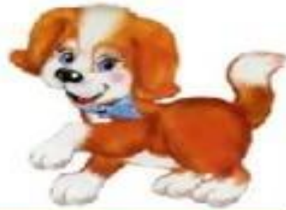
Jip the dog