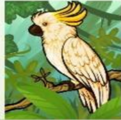
Polinesia the parrot