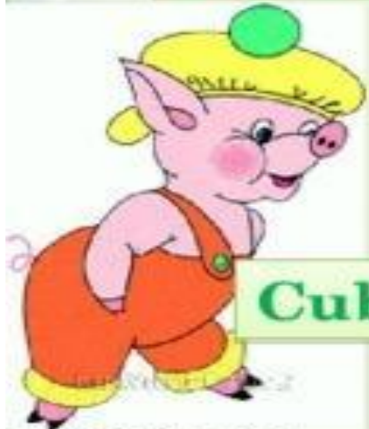
Cub-Cub the pig