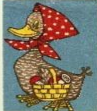
Dub-dub the duck