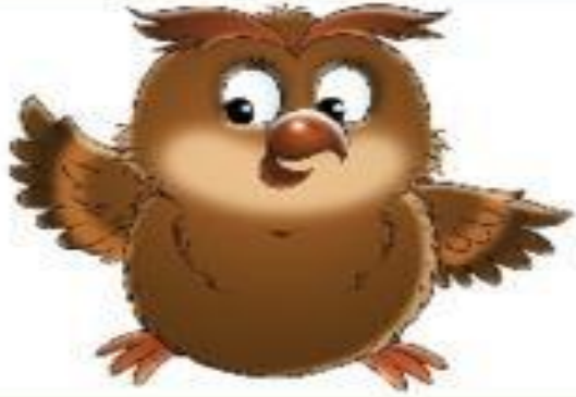
Too-Too the owl