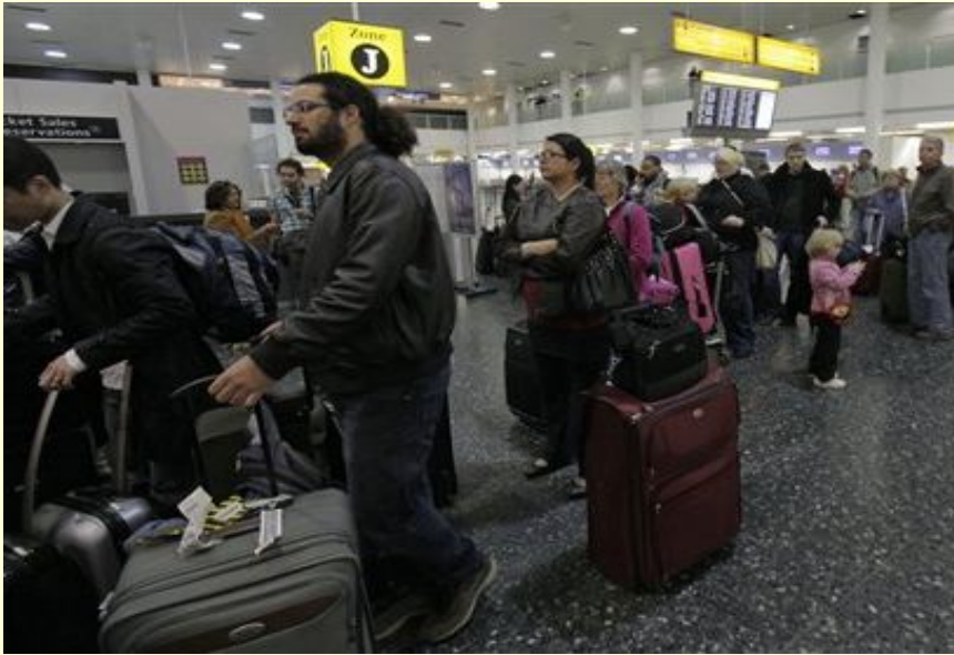
They are going to leave the country.