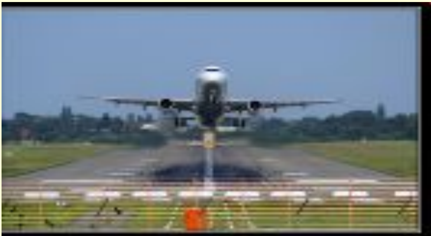
The plane is going to take off.