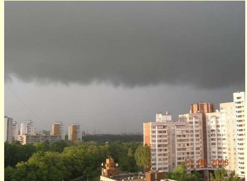
Look at the clouds! It's going to rain soon.