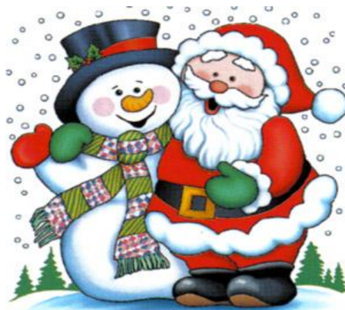
Father Christmas (Santa Claus)