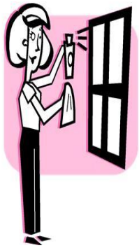
to wash the windows