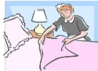
to make the bed