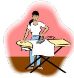
to do the ironing