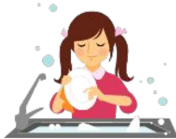
to do the washing up