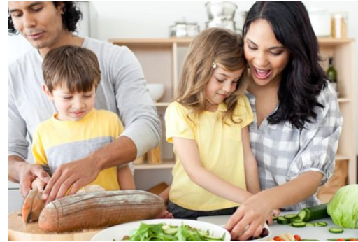
to get dinner ready