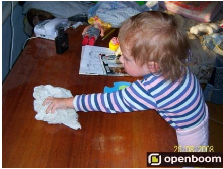
to dust the furniture