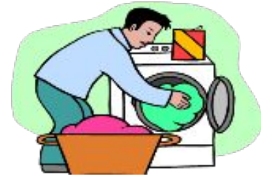
to do the laundry