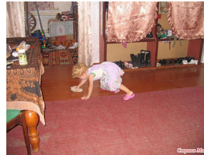
to wash the floor