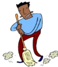
to sweep the floor