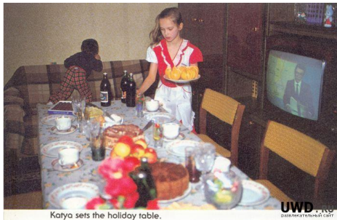
to lay the table