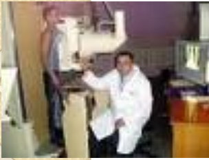
Paediatrician [p ediatriSn]