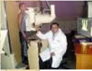
Paediatrician [p ediatriSn]