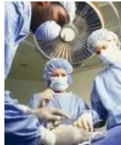
X-ray technician [eksrei tekniSn]