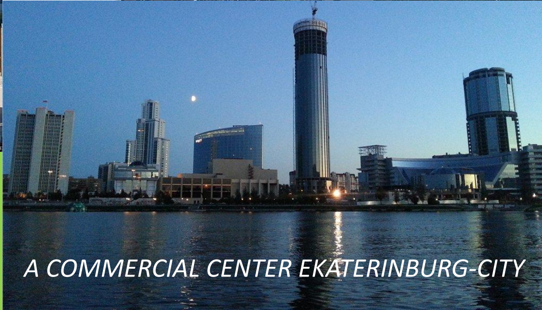
A COMMERCIAL CENTER EKATERINBURG-CITY