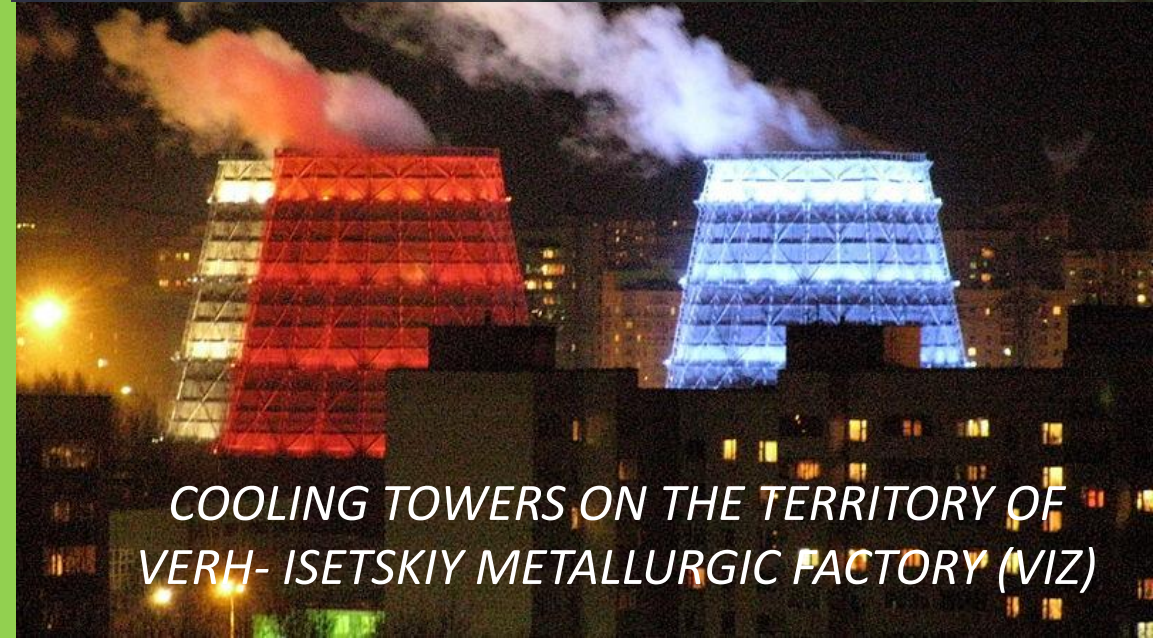
COOLING TOWERS ON THE TERRITORY OF VERH- ISETSKIY METALLURGIC FACTORY (VIZ)