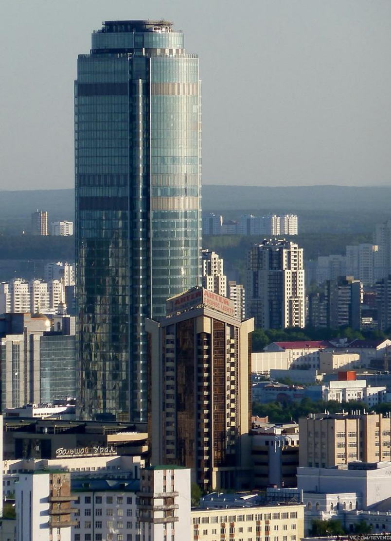
THE TALLEST BUILDING IN RUSSIA OUTSIDE OF MOSCOW - BUSINESS CENTER VYSOTSKY