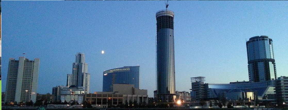
A COMMERCIAL CENTER EKATERINBURG-CITY