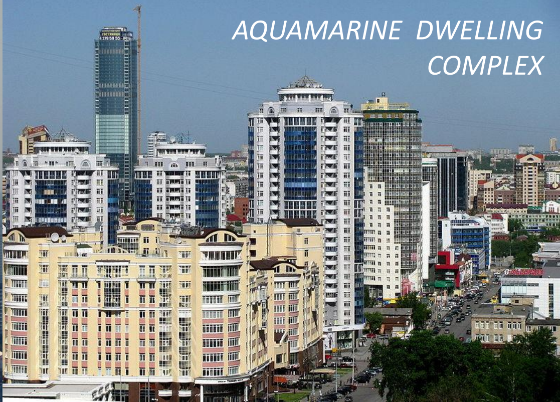
AQUAMARINE DWELLING COMPLEX