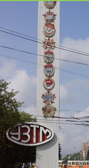
URAL HEAVY MACHINERY PLANT (URALMASH)