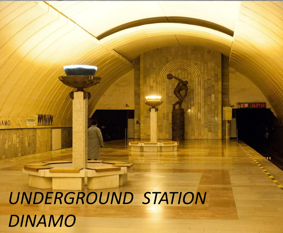
UNDERGROUND STATION ДИНАМО