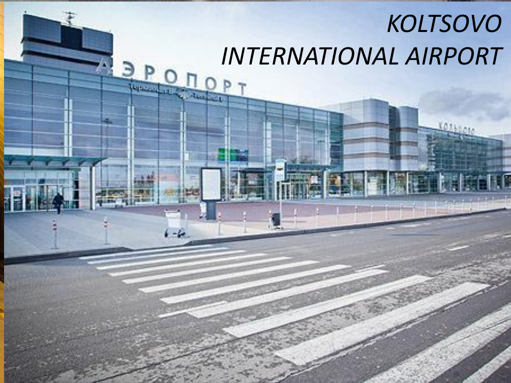
KOLTSOVO INTERNATIONAL AIRPORT