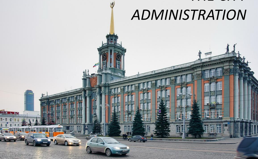
THE CITY ADMINISTRATION