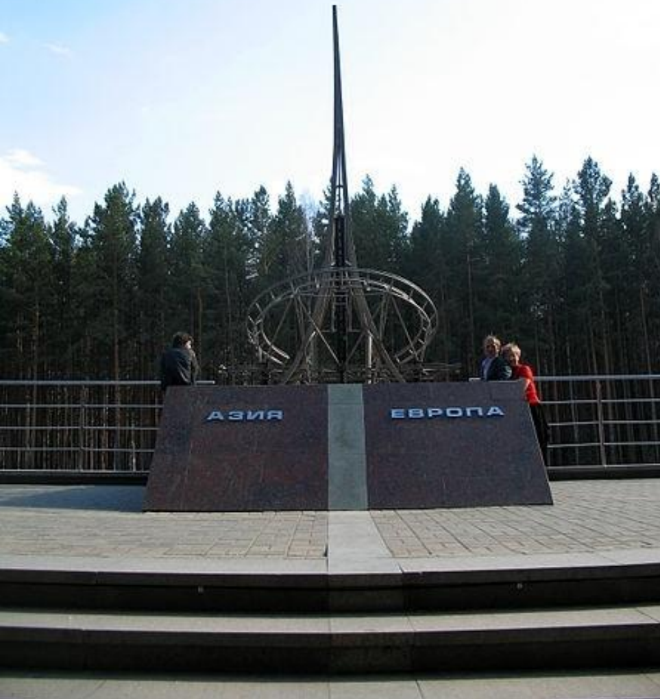
THE BORDER BETWEEN EUROPE AND ASIA

MONUMENT TO EKATERINBURG FOUNDERS V. TATISHCHEV AND G. WILHELM DE GENNIN