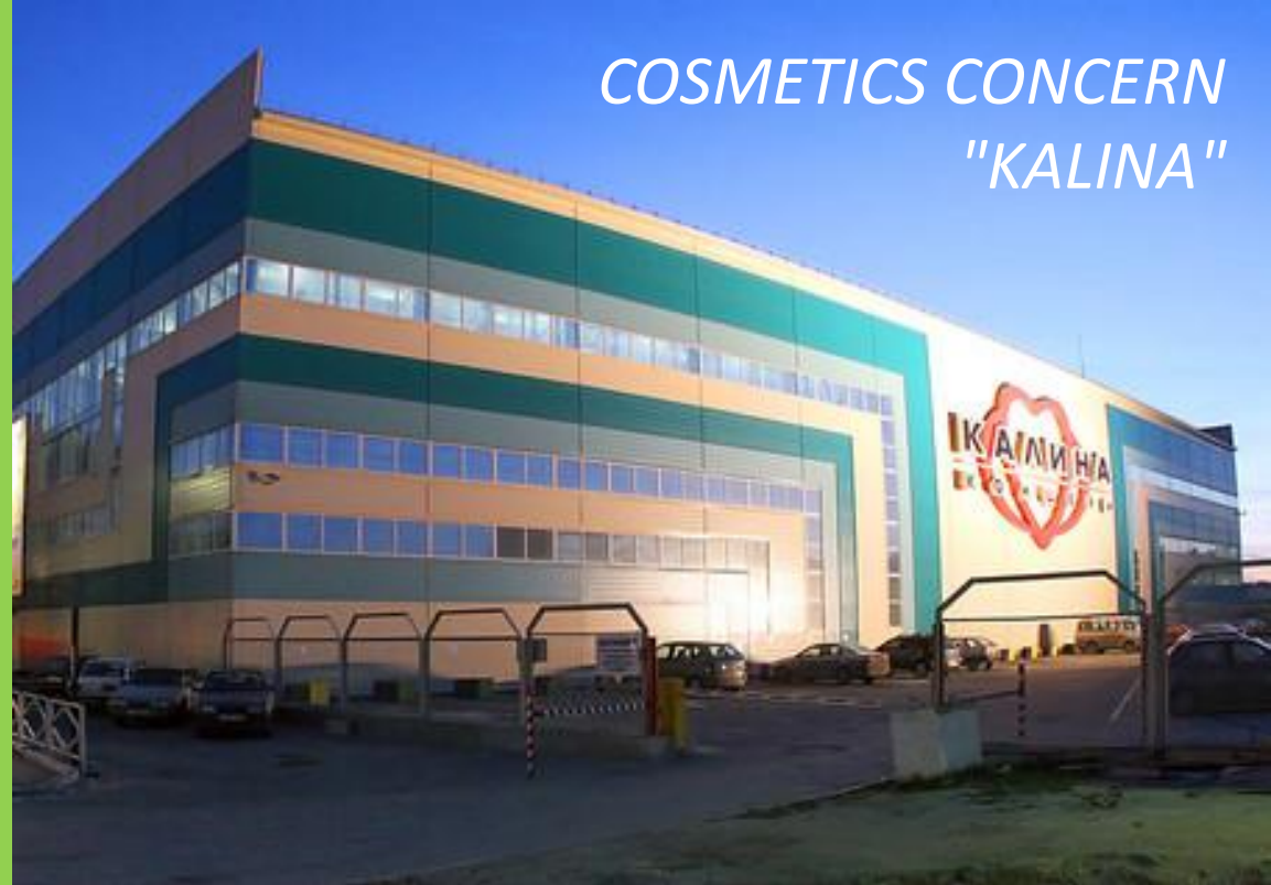
COSMETICS CONCERN "KALINA"