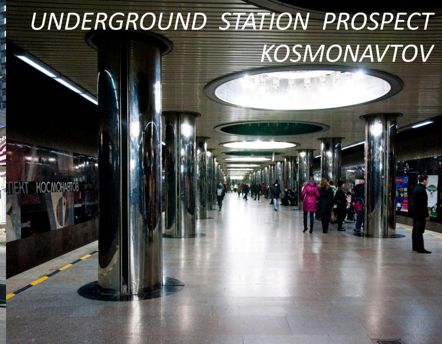
UNDERGROUND STATION PROSPECT КОСМОНАВТОВ