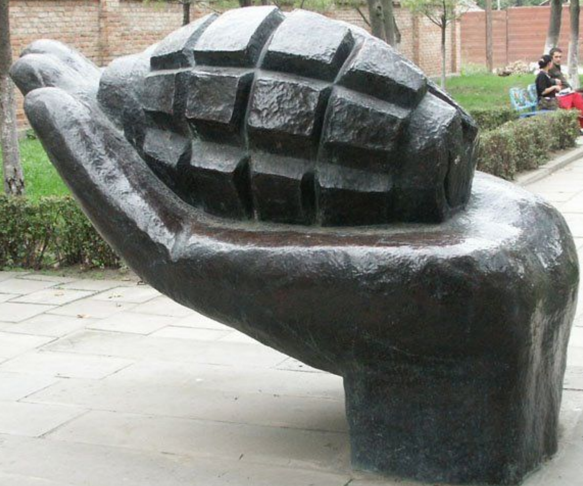
A Monument to the Heroes of the war in Afganistan.