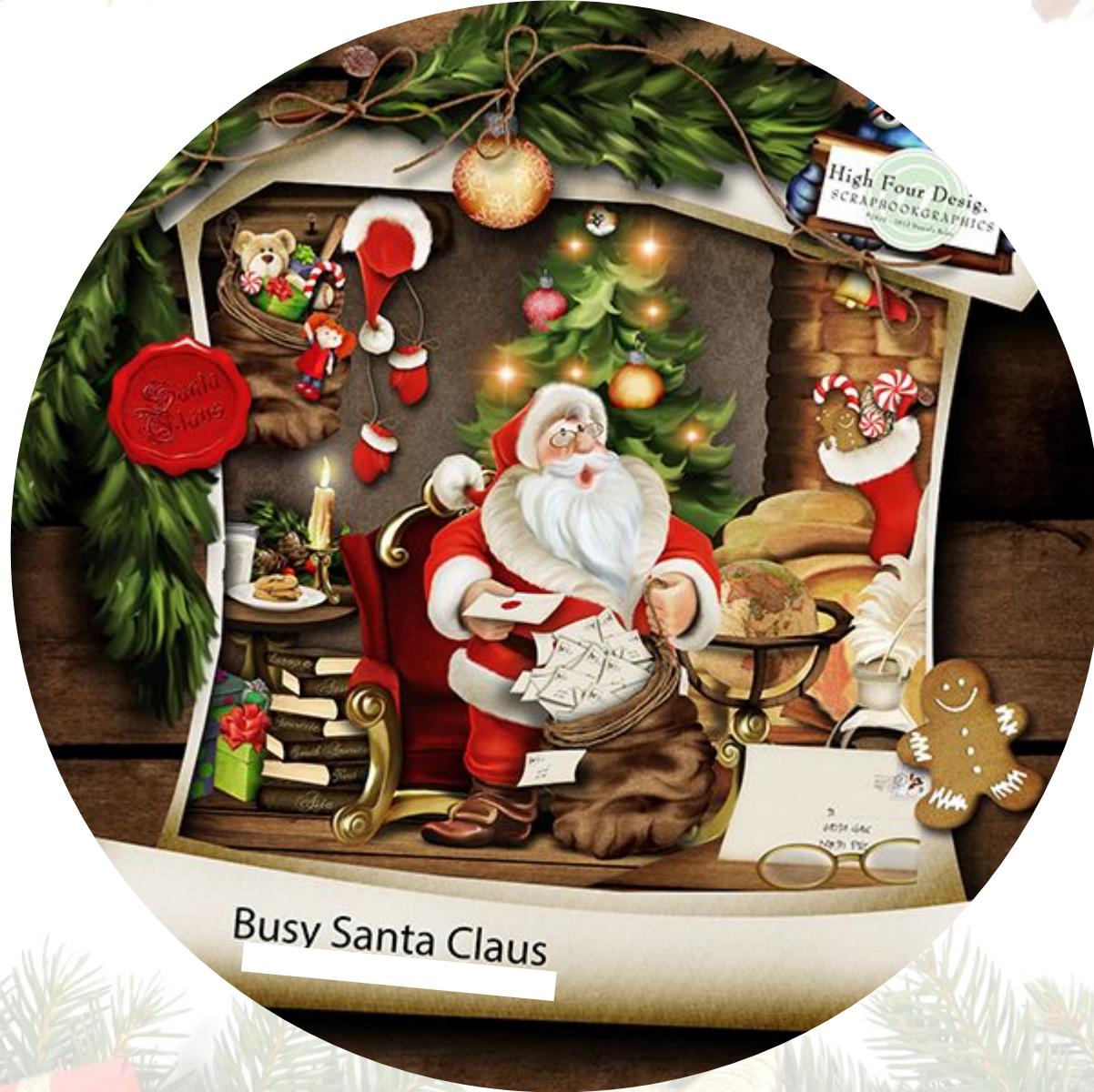
Busy Santa Claus