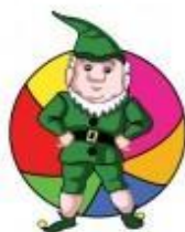
in front of