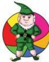
in front of