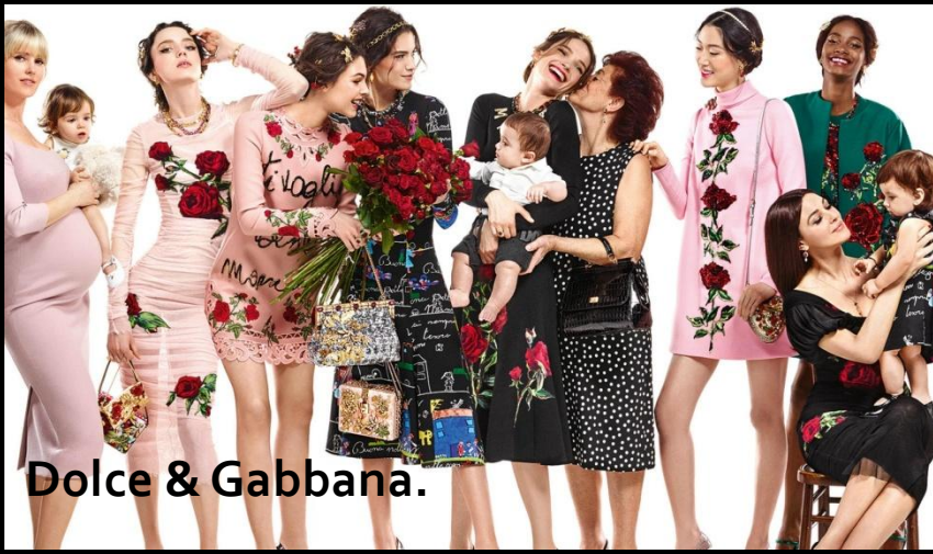
Dolce & Gabbana.