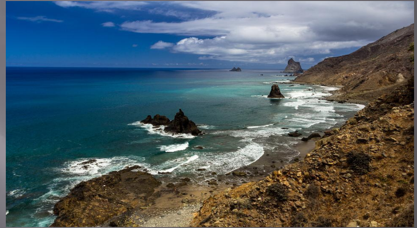
The Irish Sea