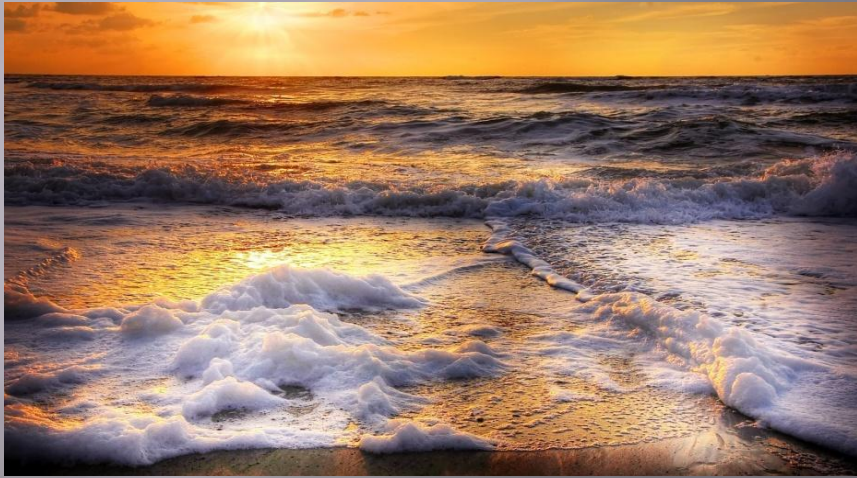
The English Channel

The British Isles are separated from European continent by the North Sea and the English Channel. The western coast of Great Britain is washed by the Atlantic Ocean and the Irish Sea.