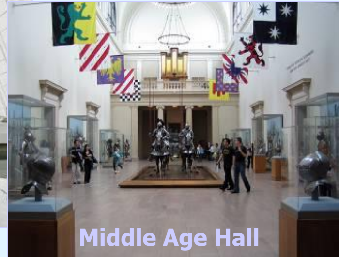
Middle Age Hall