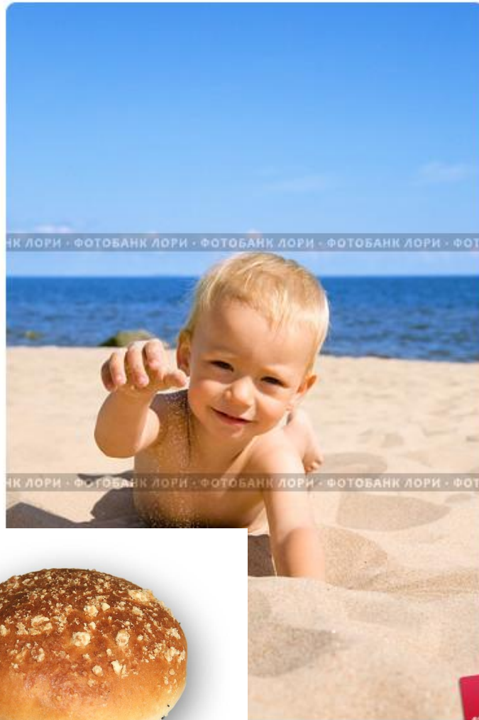
Мальчик на пляже