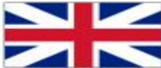
Original Union Flag (1606)