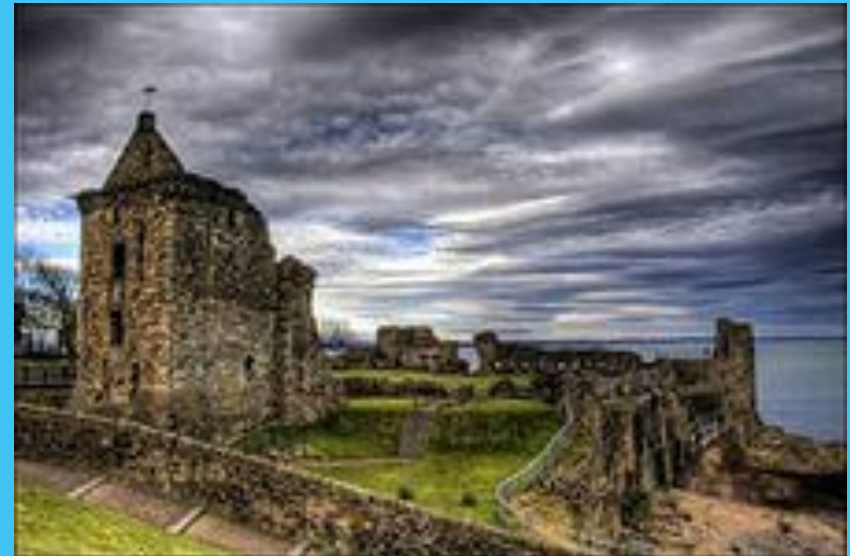
St Andrew's Castle