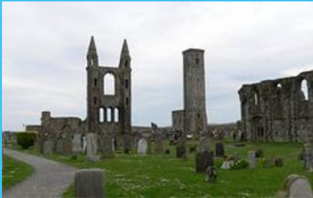
St Andrew's Cathedral