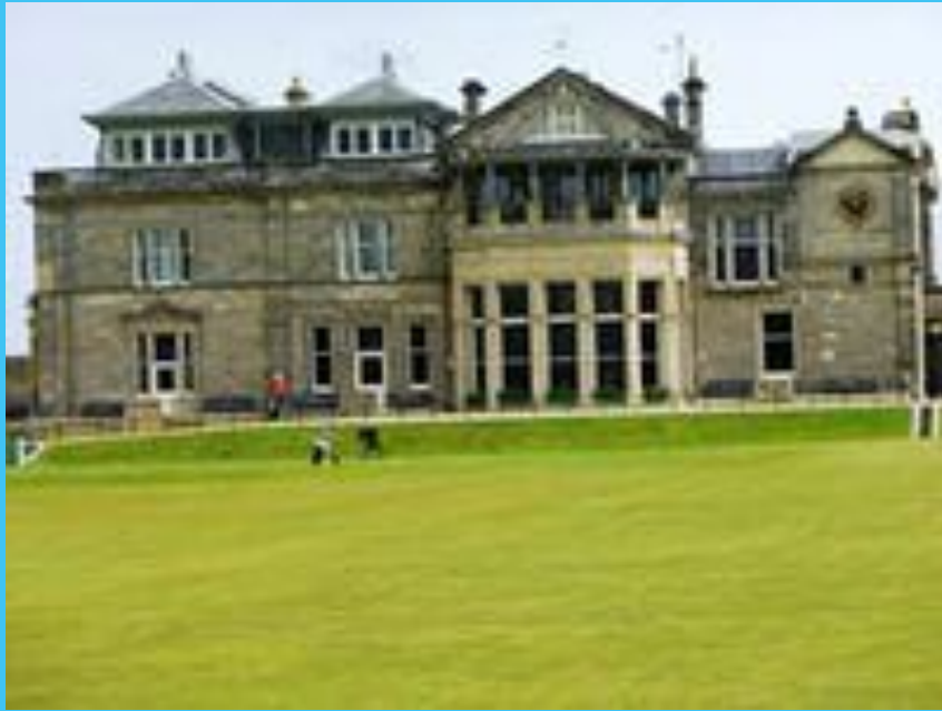
Royal and Ancient Golf Club