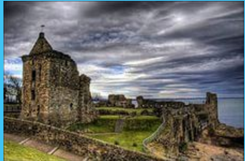
St Andrew's Castle