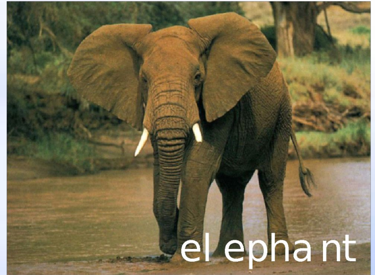
el epha nt