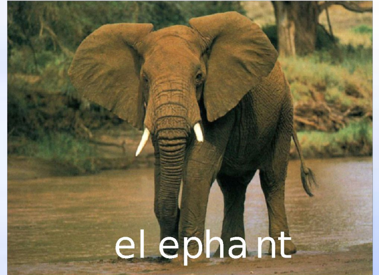
el epha nt